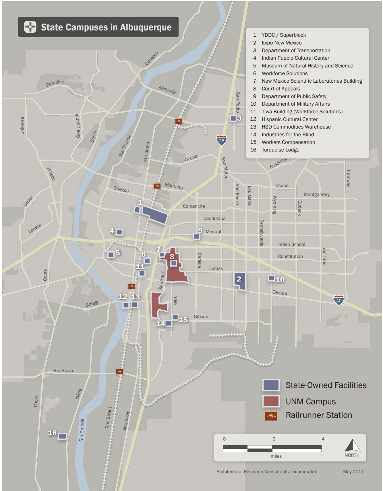
Exhibit 06. Albuquerque Campus Location Map