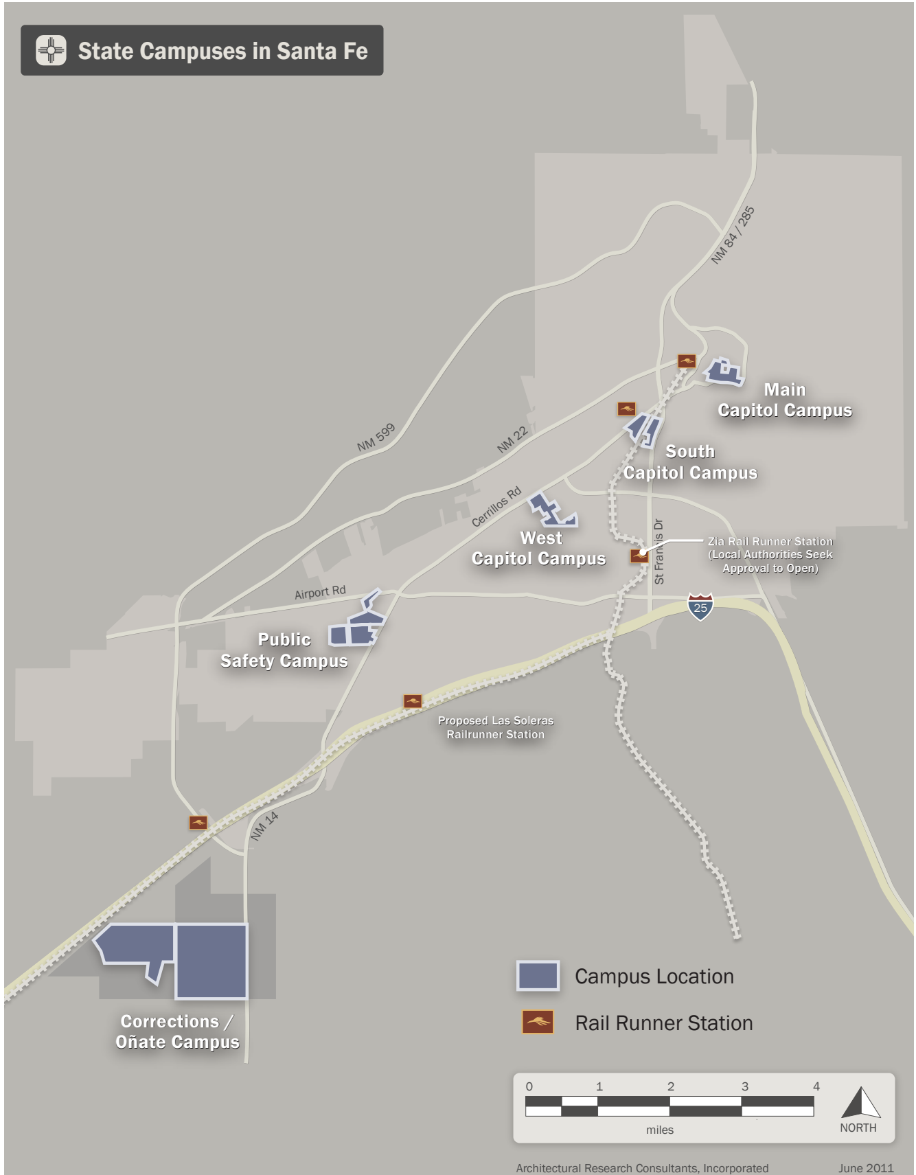
Exhibit 05. Santa Fe Campus Location Map