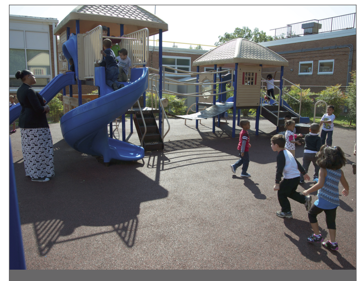
Students of all ages benefit from a break in the school day, whether they play sports or games, or simply talk with their friends, according to a new AAP policy statement. The report outlines why schools should set aside time for unstructured recess.

Just as adults take lunch and coffee breaks during the workday, the same concept applies to children, but is even more important