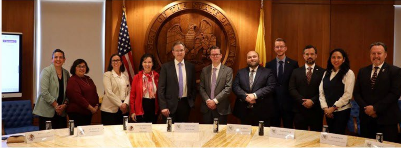
Meeting with Mexico's Ambassador to the United States, Esteban Moctezuma Barragán, and the Office of Governor Michelle Lujan Grisham - Santa Fe, New Mexico.

Reinforced alignment with federal, state, and local governments in Mexico