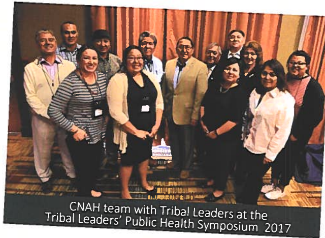
CNAH team with Tribal Leaders at the Tribal Leaders' Public Health Symposium 2017