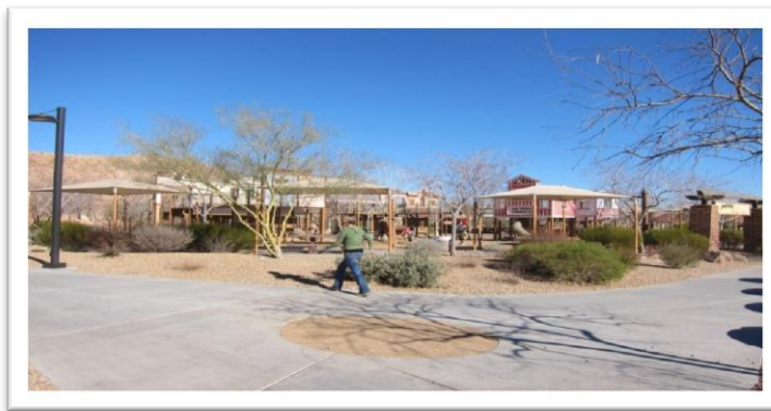
Exploration Peak Park, Mountains Edge, Las Vegas Nevada

Based on its review and evaluation, Bureau officials may approve or disapprove any application in whole or in part, or require its revision.