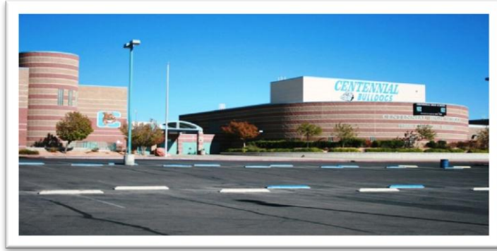
Centennial High School, Las Vegas Nevada