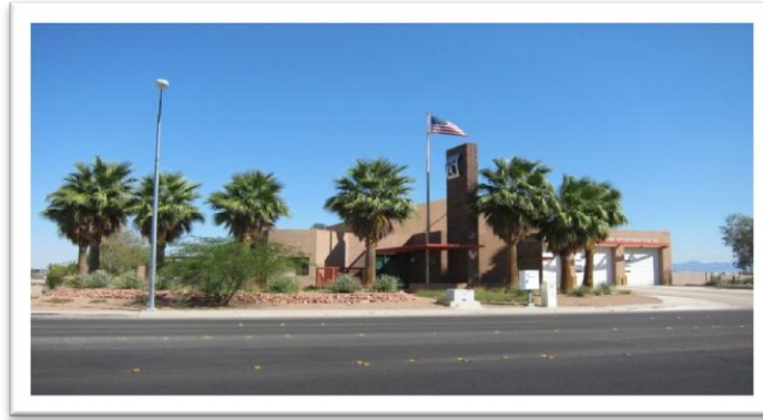
Fire Station, Las Vegas Nevada

Department of the Interior regulations for the Recreation and Public Purposes Act are found in Title 43 of the Code of Federal Regulations (43 CFR), Parts 2740 (Sales) and 2912 (Leases). The Act authorizes the sale or lease of public lands for recreational or public purposes to State and local governments and to qualified nonprofit organizations. Examples of typical uses under the Act are historic monument sites, campgrounds, schools, fire houses, law enforcement facilities, municipal facilities, hospitals, parks, and fairgrounds.