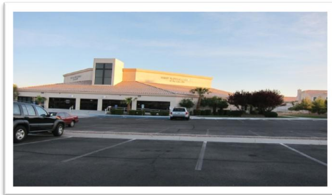
First Baptist Church of the Lakes, Las Vegas Nevada