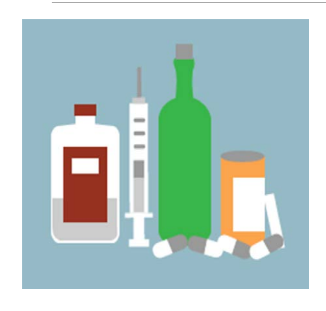
Behavioral Health & Substance Use Disorders