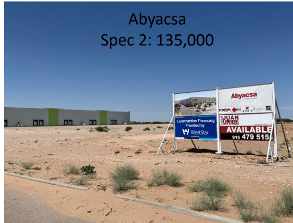
Abyacsa Spec 2: 135,000