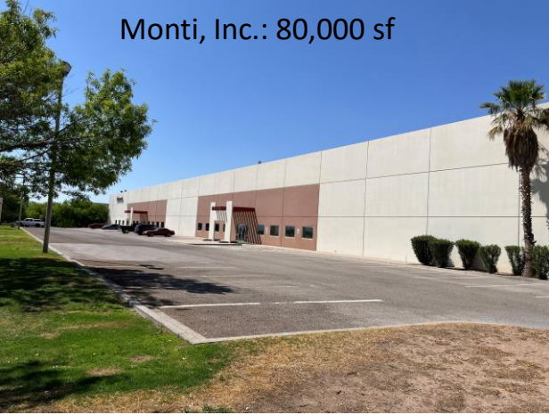
Monti, Inc.: 80,000 sf