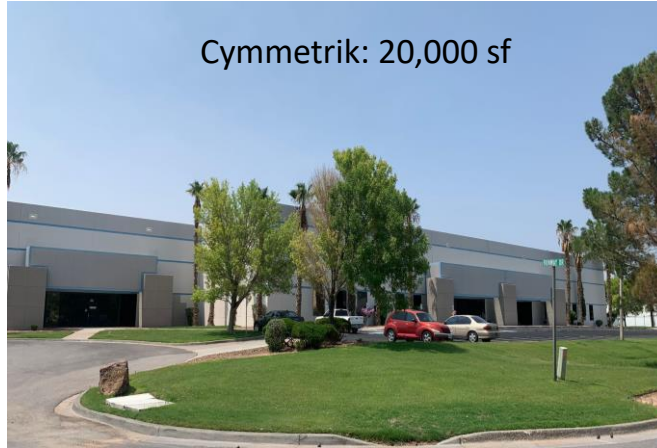
Cymmetrik: 20,000 sf