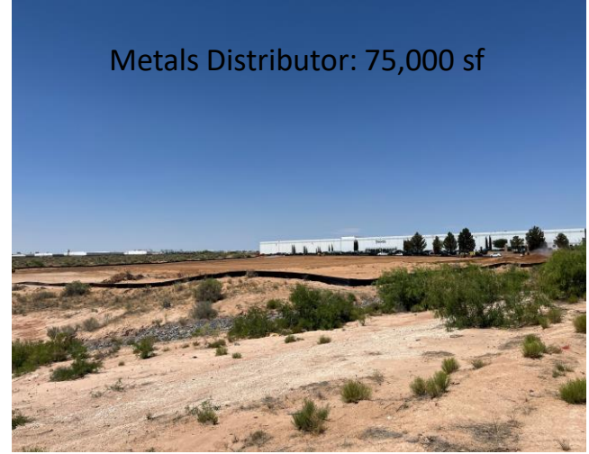
Metals Distributor: 75,000 sf