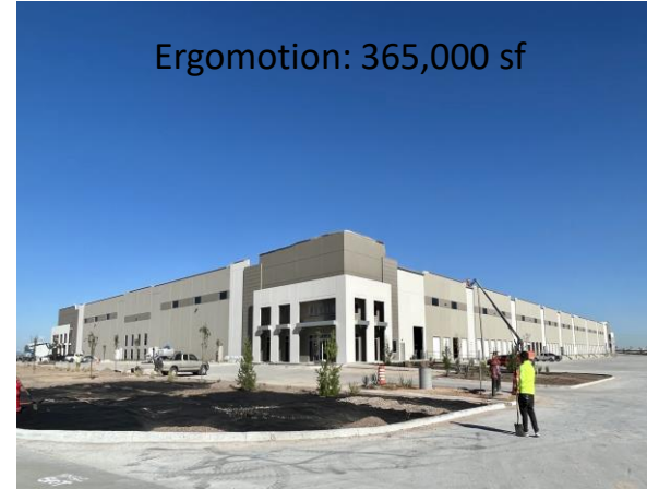
Ergomotion: 365,000 sf