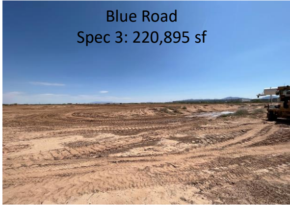
Blue Road Spec 3: 220,895 sf