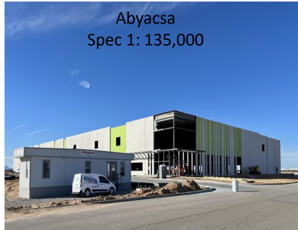
Abyacsa Spec 1: 135,000