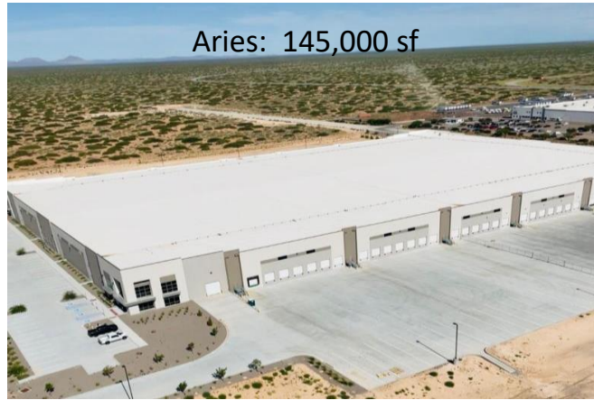
Aries: 145,000 sf