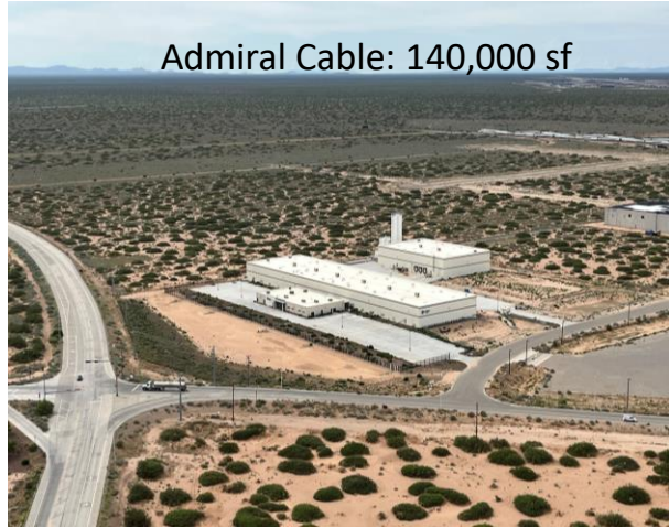
Admiral Cable: 140,000 sf