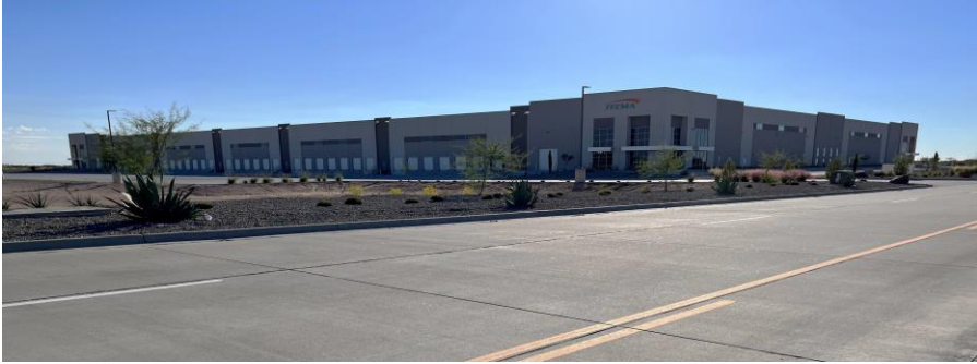
Blue Road Investments Spec 1: 315,000 sf