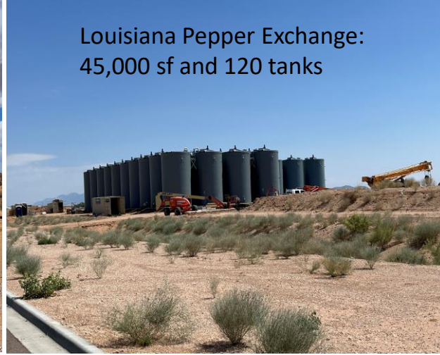
Louisiana Pepper Exchange: 45,000 sf and 120 tanks