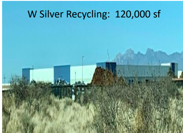
W Silver Recycling: 120,000 sf