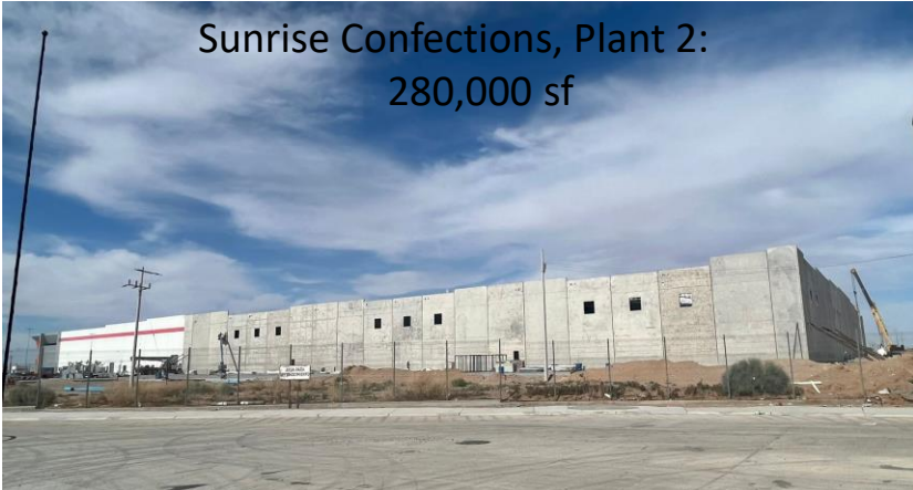
Sunrise Confections, Plant 2: 280,000 sf