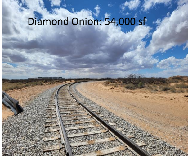
Diamond Onion: 54,000 sf