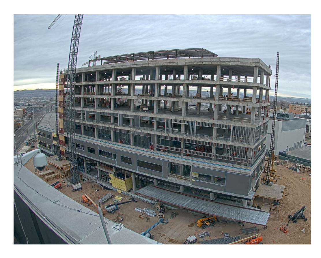
January 1, 2023