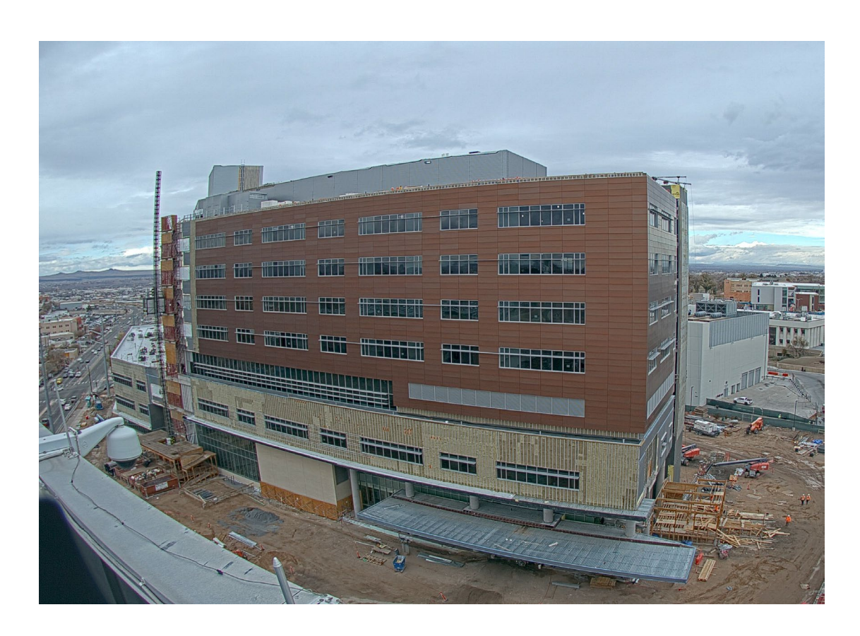
December 1, 2023