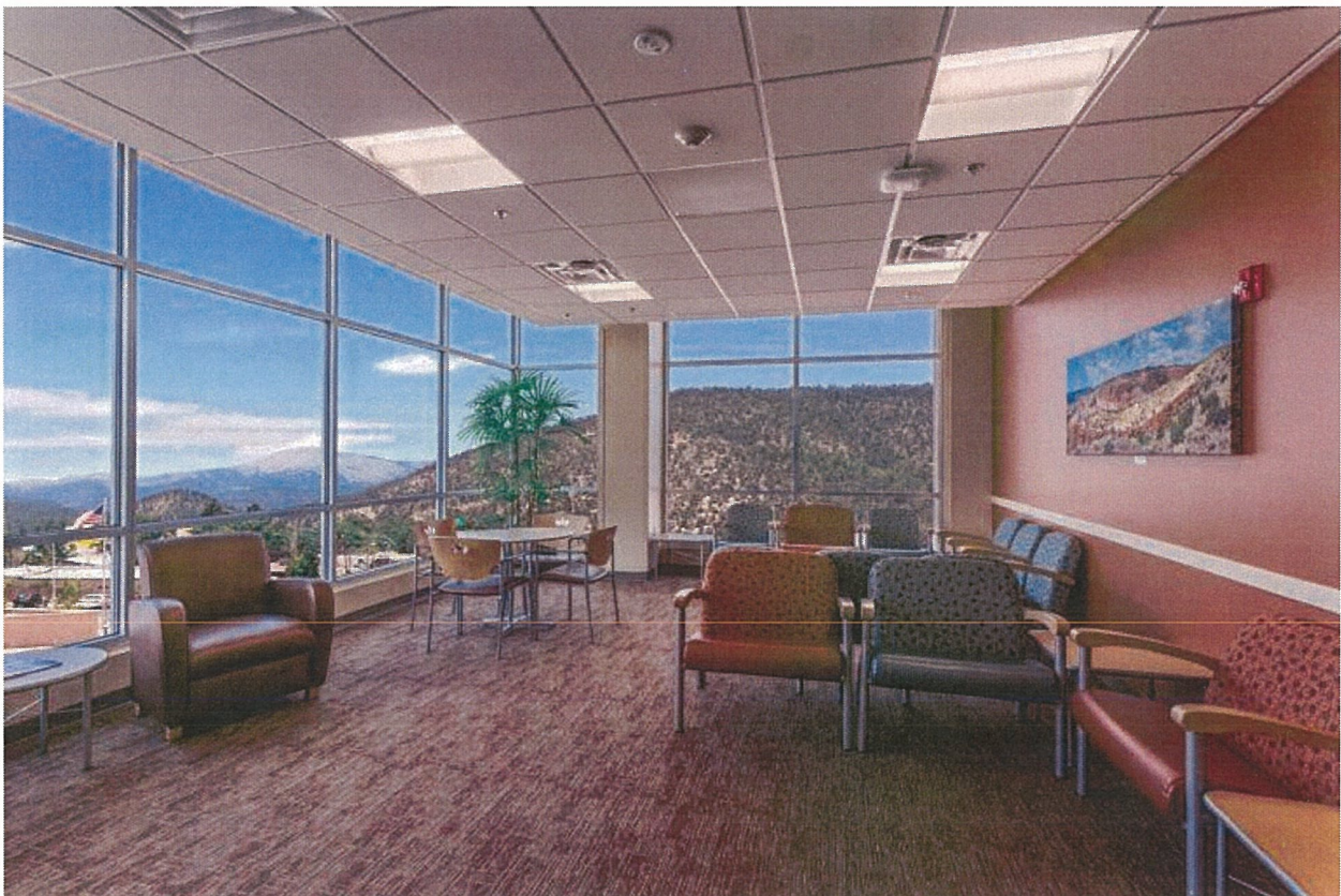
A rendition of what the new lobby will look like upon completion of the new hospital

We are building a new replacement hospital. This is one of the only new replacement hospitals in the State of NM. Ruidoso is known for being a wonderful place to retire making reliable medical services vital to our economy. Lincoln County owns the Medical Center and Presbyterian Healthcare leases the facility from the County. Due to the great relationship between Lincoln County and PHS along with the voting residents agreeing to increase property taxes if necessary, this project will come to fruition.