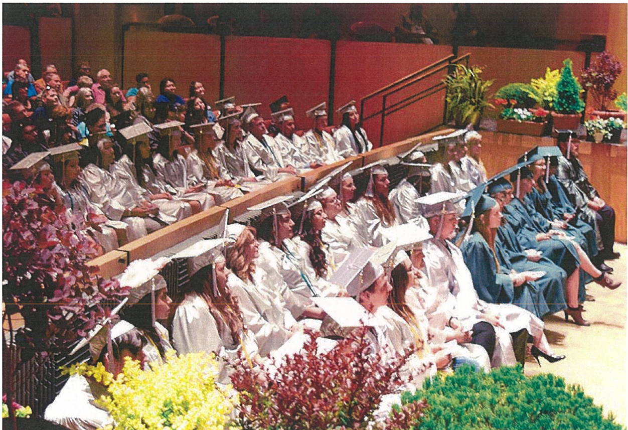
Graduation 2017 at ENMU-Ruidoso

entry remodel is under way. ENMR-Ruidoso is vital to the growth and welfare of our economy and during last year's session we were concerned by the legislation and budgetary threats to higher education. We need to make sure that you understand the importance of higher education in rural communities. This campus provides affordable education to our local workforce who does not have the opportunity or finances to attend a larger institution. Those workers can maintain a job and work towards necessary certifications to increase their earning potential. In addition, ENMU-Ruidoso works very closely with the local schools throughout the County to provide dual credits for high school students, giving our youth a head start on a college education. Aside from various certifications and associates degrees, the University serves our retired community with the Creative Aging Resource Center.