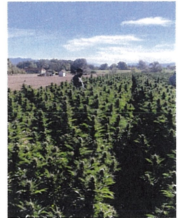
Hemp for CBD just prior to harvest