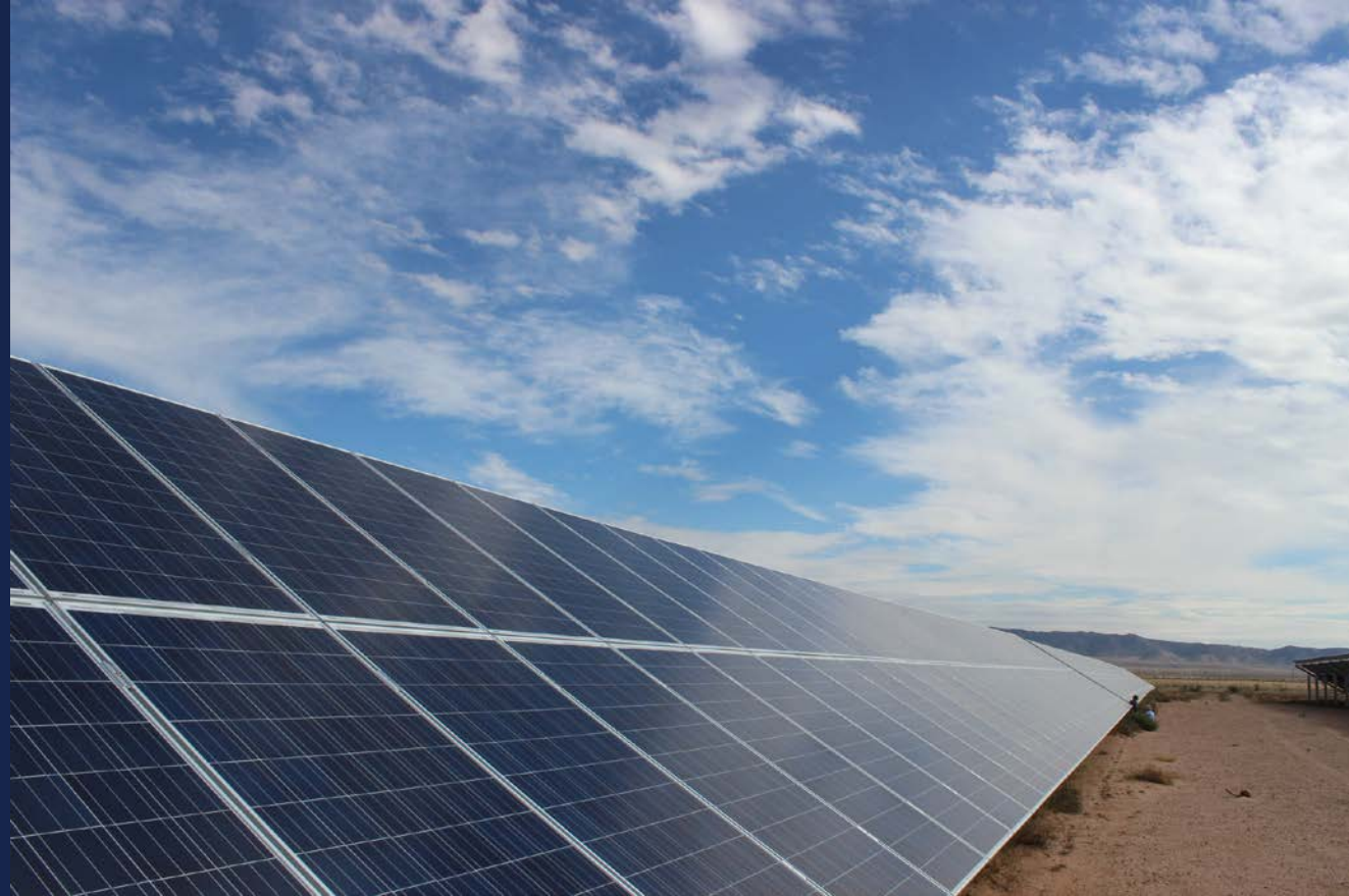
HAW Dairy Belen, NM