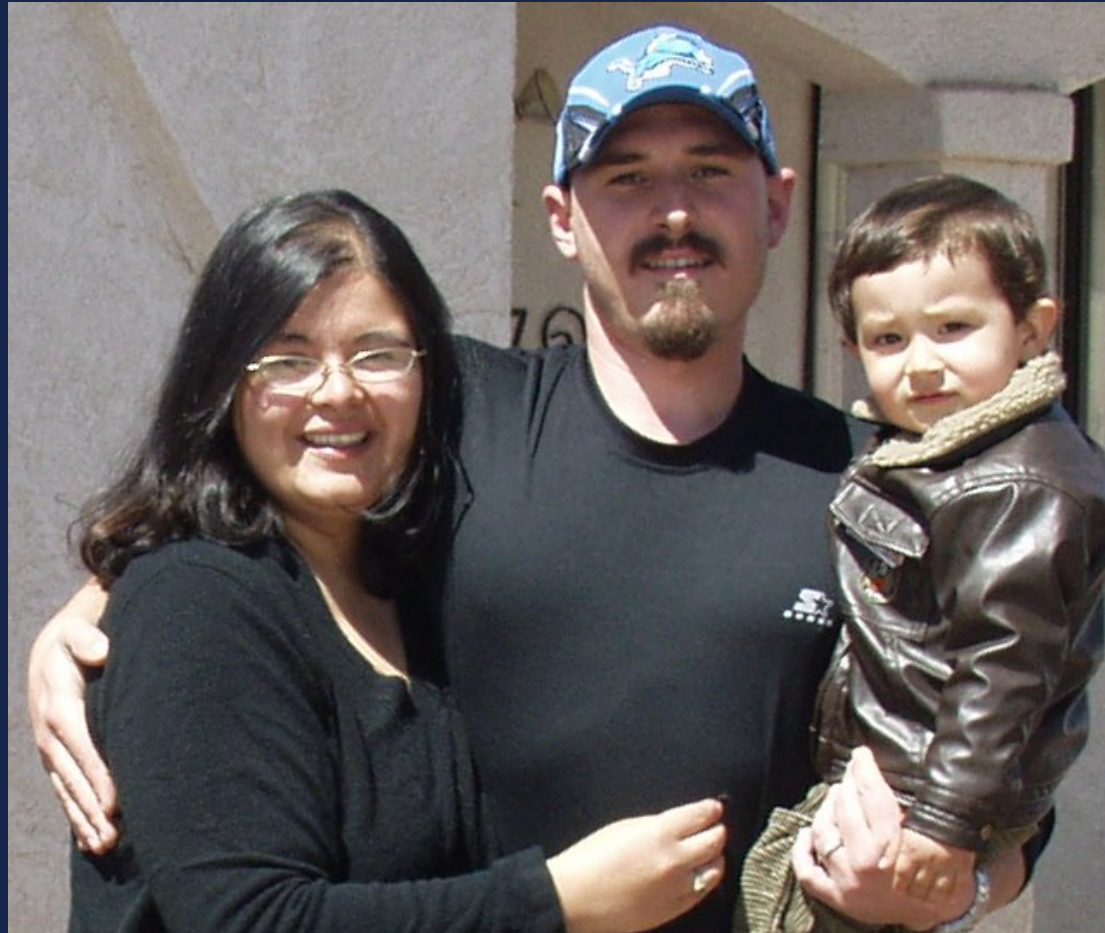
Coker Family Los Lunas, NM