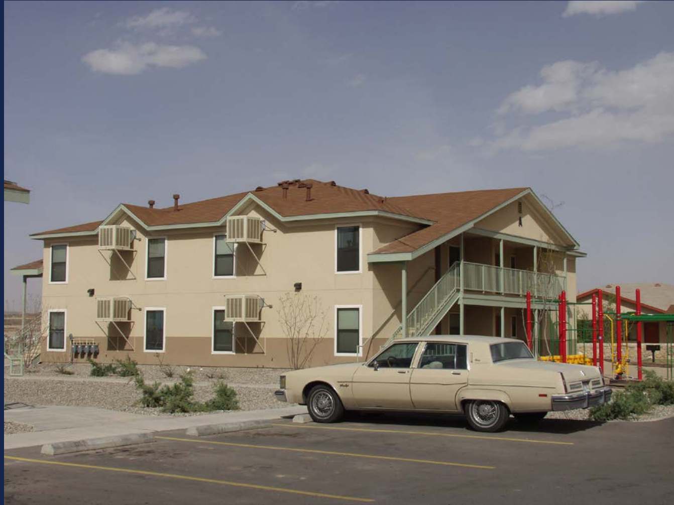
Franklin Vista Apartment Complex Anthony, NM