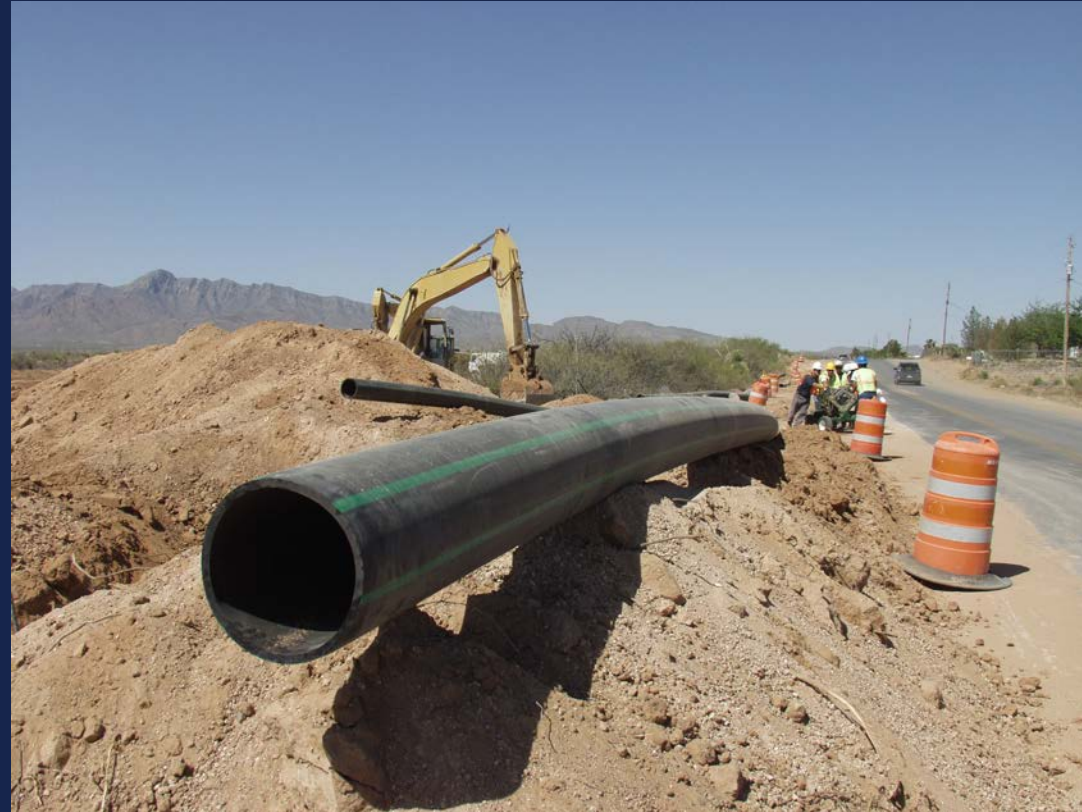
Wastewater System Construction Chaparral, NM