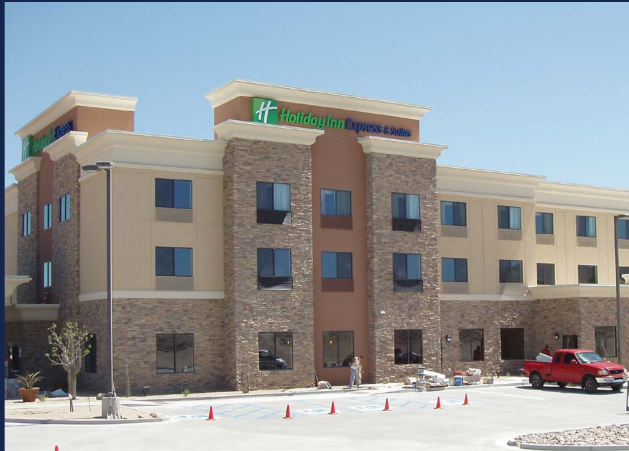
Holiday Inn Express Truth or Consequences, NM