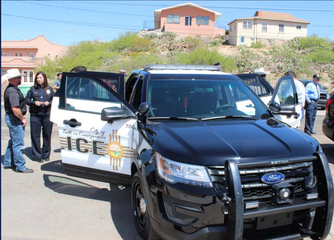
Police Cars Truth or Consequences, NM