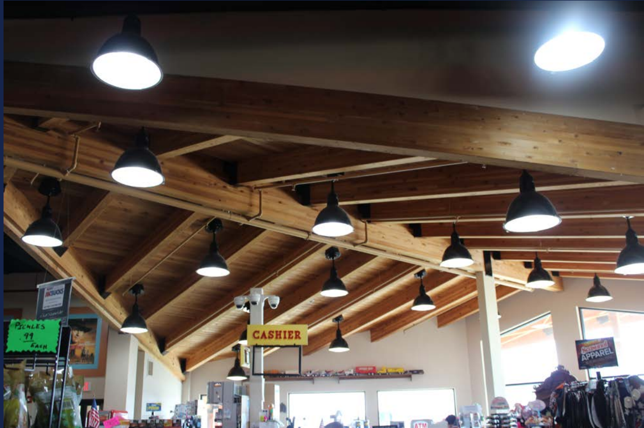
Russel's Truck Stop Energy Efficient Lighting San Jon, NM