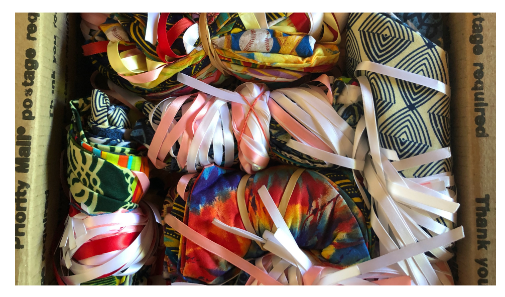
Private facemask donation through SF Indian Center and NB3