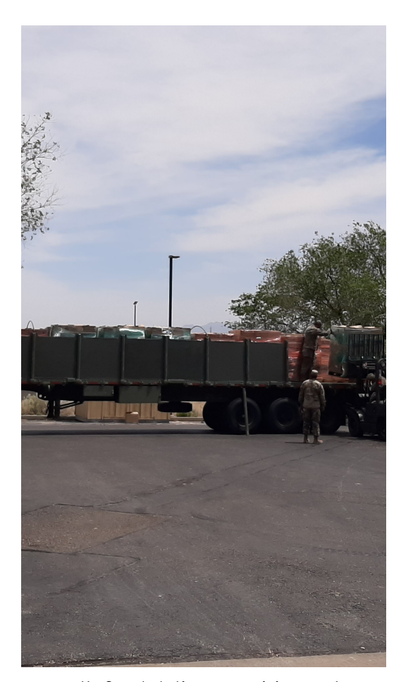
Bulk food delivery waiting to be broken down by National Guard and volunteers