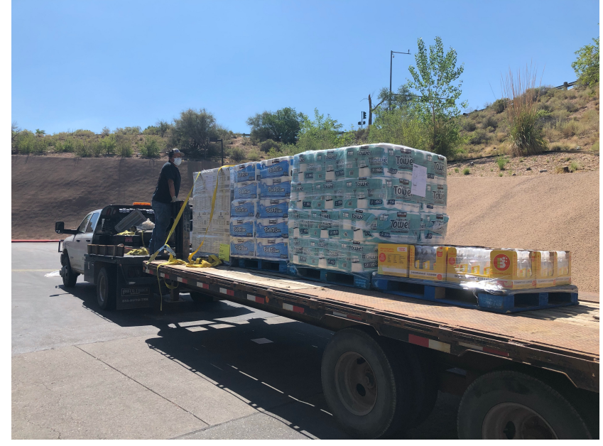
Private supply donation from NM Foundation