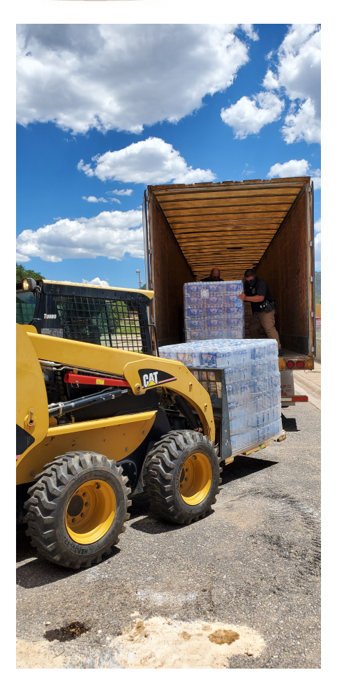
19 pallets of water to Mescalero through Thornburg Foundation funds.