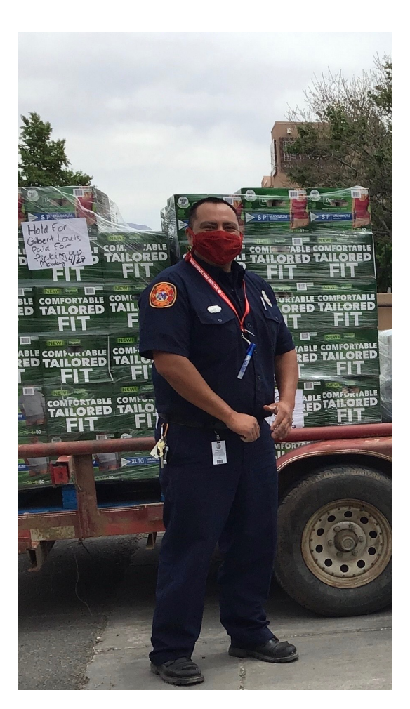
IAD coordinate purchase of Adult diapers and toothpaste with IPCC