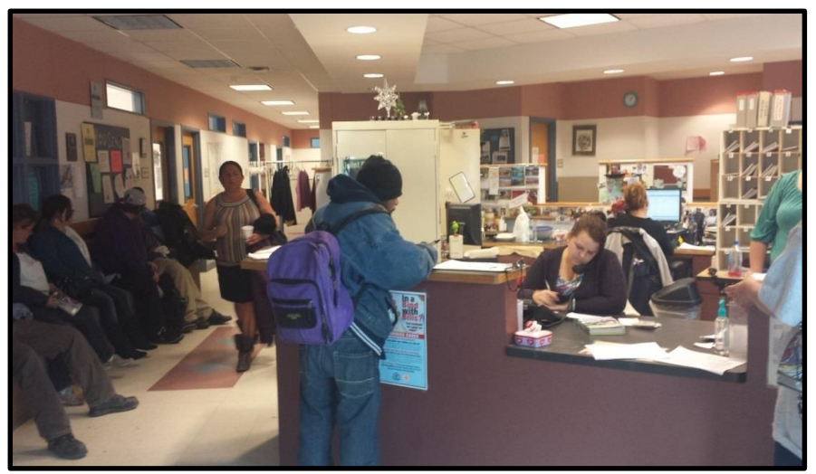
Day Shelter services Income support Camp Hope shelter HOUSING