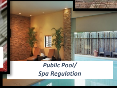
Public Pool/ Spa Regulation