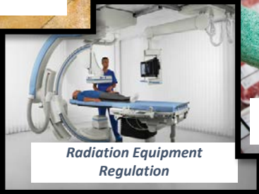
Radiation Equipment Regulation