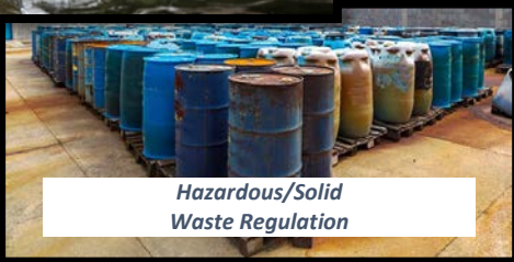
Hazardous/Solid Waste Regulation