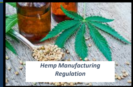
Hemp Manufacturing Regulation