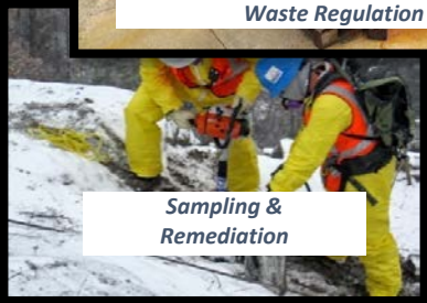
Sampling & Remediation