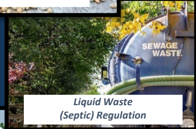
Liquid Waste (Septic) Regulation