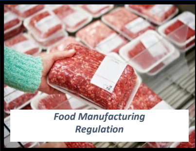
Food Manufacturing Regulation