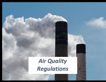
Air Quality Regulations

To protect and restore the environment and to foster a healthy and prosperous New Mexico for present and future generations.