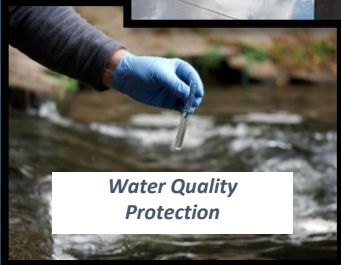
Water Quality Protection