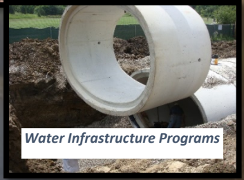
Water Infrastructure Programs