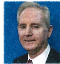
District Three Transportation Commissioner