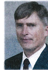
District Three Engineer