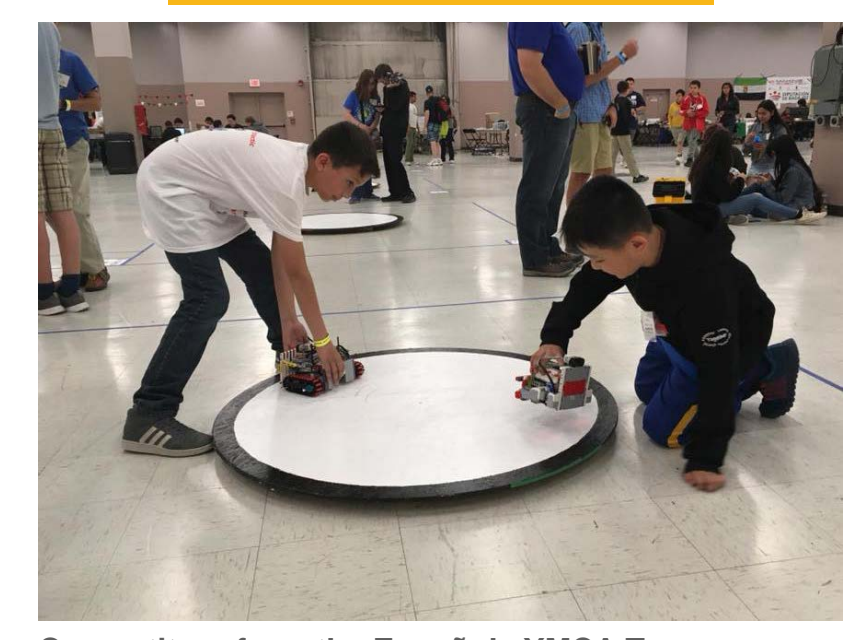
Competitors from the Española YMCA Teen Center compete at the 2018 RoboRAVE International event in Albuquerque. The Center is supported by Los Alamos National Laboratory.