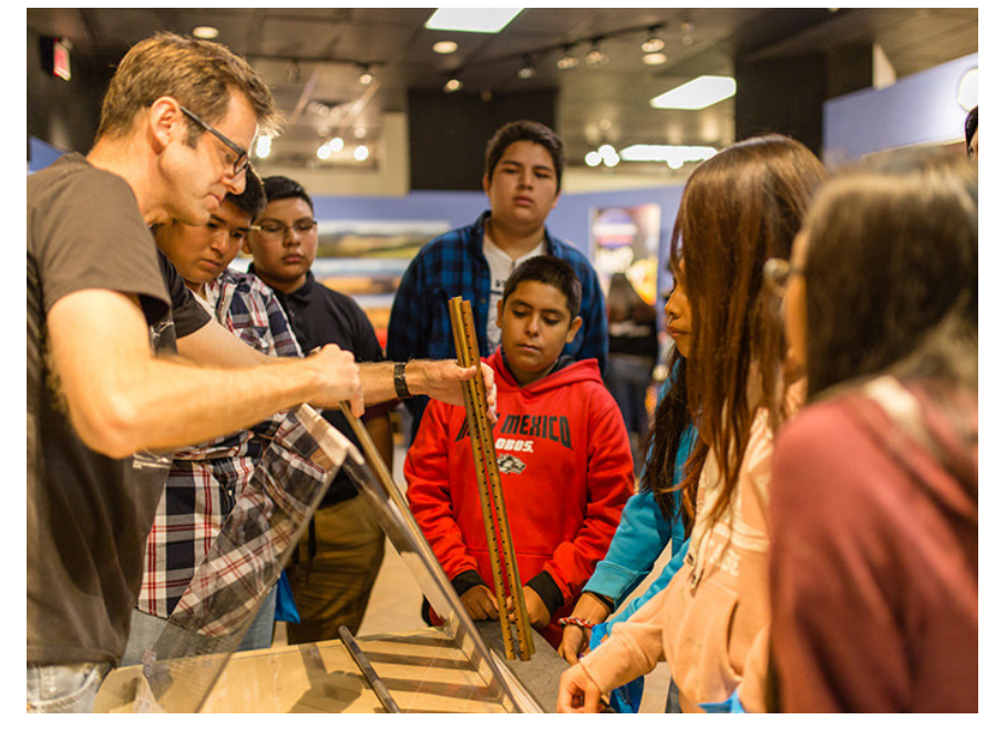
Santa Fe Indian School students watch a demonstration from a Lab researcher as a part of the STEM Mentoring Café program.

The Laboratory wants to play a strong leadership role in STEM education