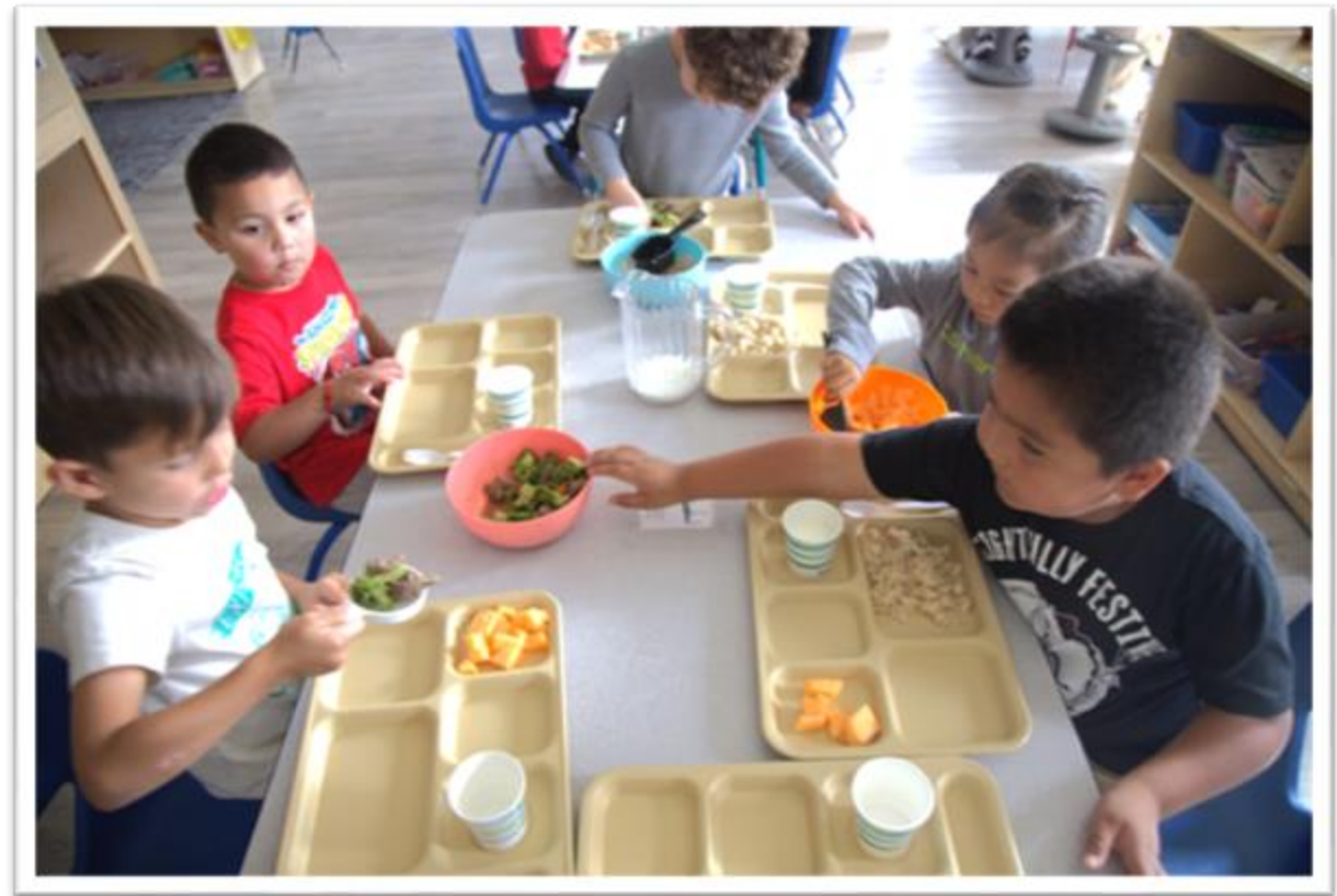
Family style dining with NM Grown local foods, A Gold Star Academy, Farmington NM