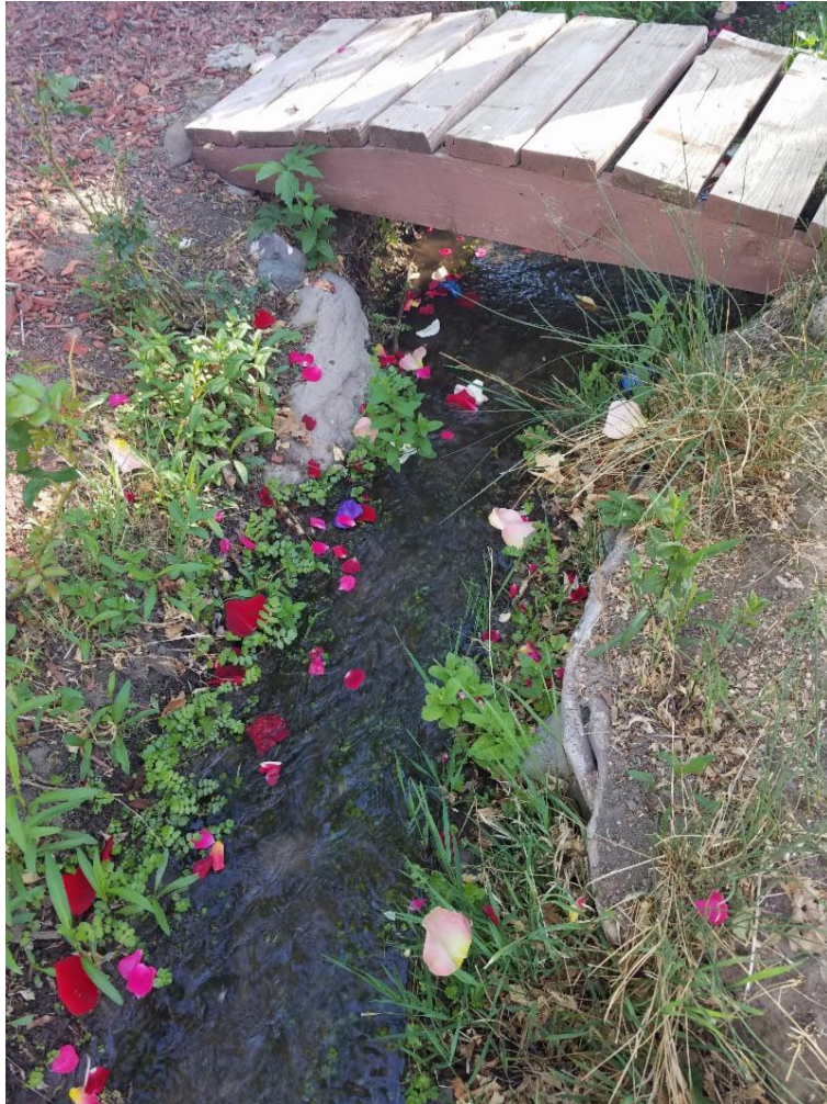
Above: Rose petals flow in an acequia during a water blessing for Día de San Isidro