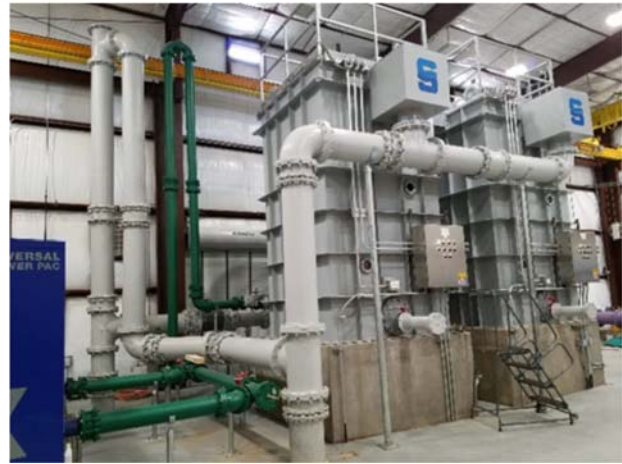
Clovis Reuse System Phase 1B, Additional blower Filter Unit Funded by CO SAP and WTB

As of June 30, 2017, CPB was performing administration and construction oversight for 207 active projects with an outstanding balance of $34,682,360. CPB successfully closed 92 projects valued at $16,977,037 from July 1, 2016 through June 30, 2017.