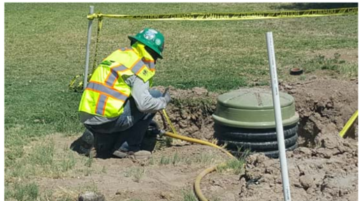
Grinder Pump Installation