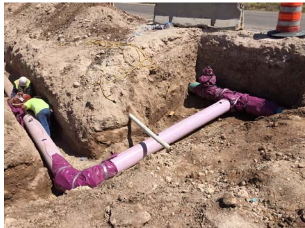
12 Inch Reuse Pipe Installation