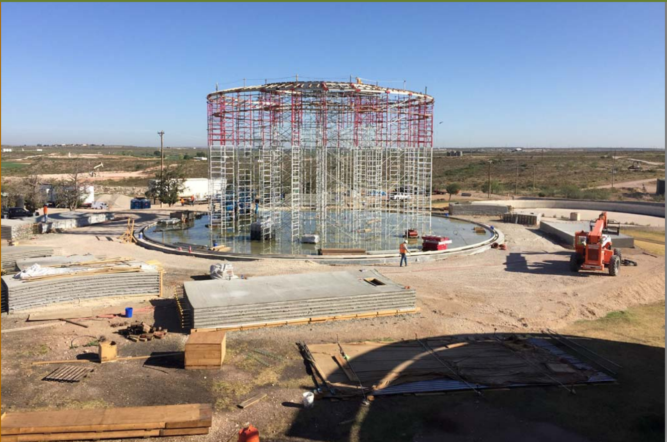
Carlsbad Water Reuse Project: Water Tank - Funded by the Clean Water State Revolving Fund