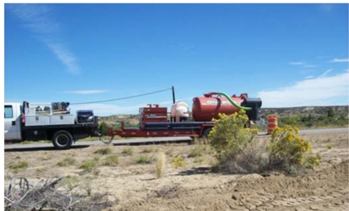
Upper La Plata MDWC Equipment to Excavate Around Existing Gas Lines For Water Capacity Project Funded by CO SAP and NMFA-DW