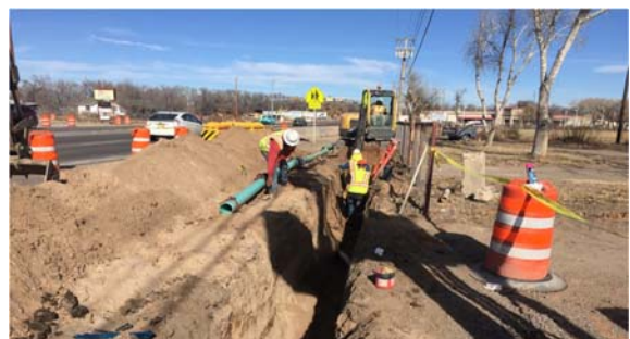
Peralta Installation of 8" Sewer Line along HWY 47

As of June 30, 2017, CPB had 17 active RIP Construction Projects, with an undisbursed total loan and grant balance of $6,224,154. There are currently 73 loans in repayment with a principal balance of $14,850,701.