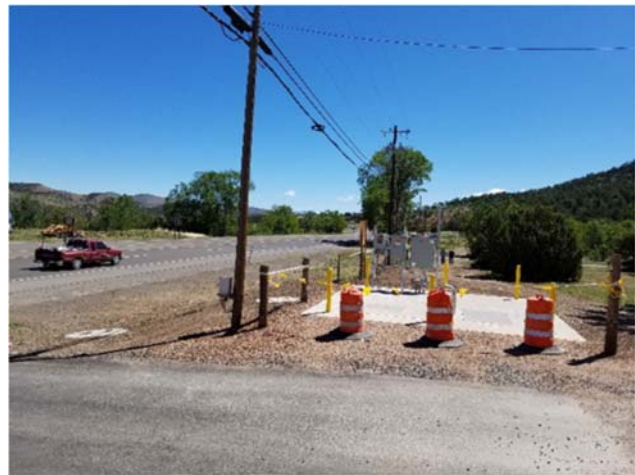
Ruidoso Downs Wastewater Collection System New Lift Station on Highway 70 Funded by CO SAP and CIF