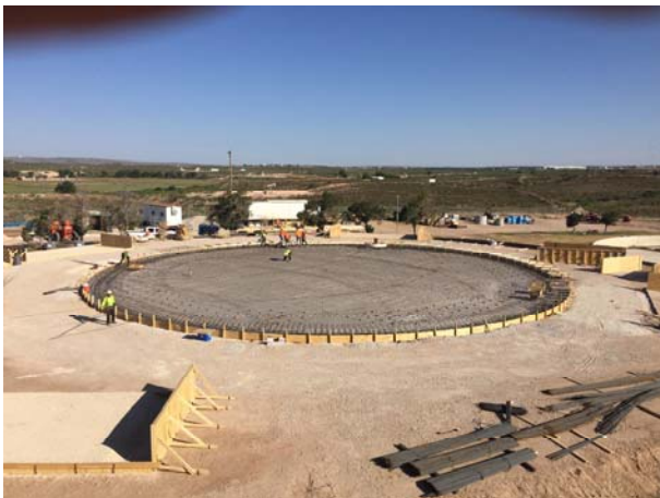
Concrete Form and Rebar Tank Foundation

The CWSRF award was originally made to the City in 2010 for purposes of upgrading the wastewater treatment facility, then later expanded to include the phased reuse project to use the remaining $1.35 million balance. The WTB funding was for $2.5 million. The EPA SAAP grant was for $291,000. NMED-CPB staff worked closely with the City to secure the EPA grant and follow all requirements associated with the CWSRF fund and the EPA SAAP grant. - Sara Rhoton, P.E.