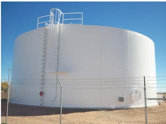
Hagerman New Water Tank on Highway 70 Funded by CO SAP and WTB