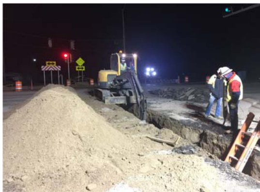
Installation of 6" Sewer Lines along Molina Drive