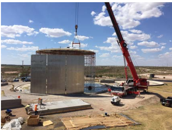
Placement of Tank Panels