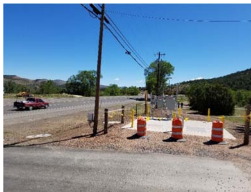
City of Ruidoso Downs Agua Fria Wastewater Collection System, Phase II, Funded by CO SAP and CIF