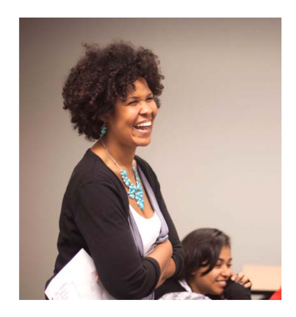
These career changers are finding a new opportunity - right in their own communities.