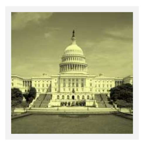
State Voice in D.C.

NCSL delivers training tailored specifically for legislators and staff