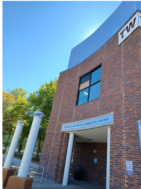
Albuquerque, NM CNM campus,