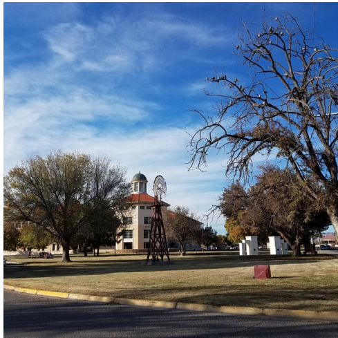
Las Cruces, NM NMSU campus