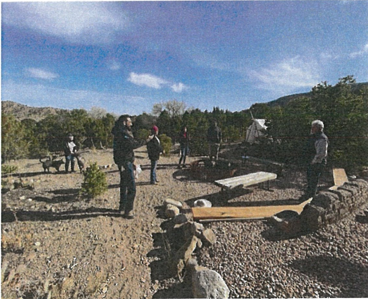
Ancestral Lands Conservation Corps staff around the San Antonio de las Huertas Land Grant's Campo del Oso campsite.