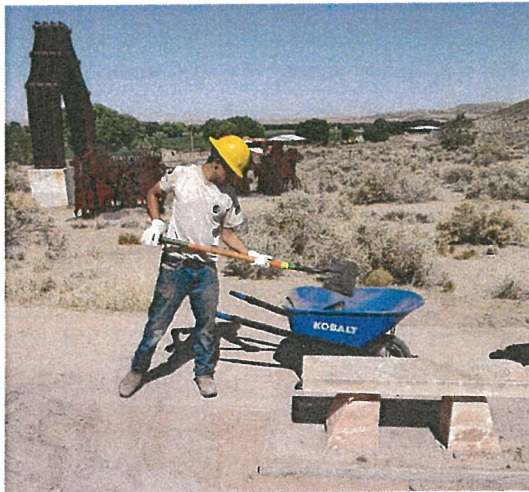
A Merced YCC crew member clears sand from the path at Cerro Tomé Park

The Land Grant-Merced Regional Outdoor Recreation Project, which is serving land grant communities in the East Mountains and Albuquerque (outskirts), began on June 7 th . Youth from land grant communities and other areas are hired for a ten-week period to complete various projects. The crew began working in the Town of Tomé Land Grant at the beginning of June, where they built swales and improved a walking path around the Cerro Tomé Park. The Crew just completed work in Chililí building a roadside trail to their community park and will work on the path surrounding Manzano Lake in the coming weeks. Other land grants involved in this project include Cañon de Carnué, San Antonio de las Huertas, Tajiique, and Torreón.