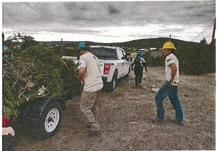
Merced YCC Crew members load slash at Chililí

The Land Grant-Merced Regional Outdoor Recreation Project, which is serving land grant communities in the East Mountains and Albuquerque (outskirts), began on June 7 th . Youth from land grant communities and other areas are hired for a ten-week period to complete various projects. The crew began working in the Town of Tomé Land Grant at the beginning of June, where they built swales and improved a walking path around the Cerro Tomé Park. The Crew just completed work in Chililí building a roadside trail to their community park and will work on the path surrounding Manzano Lake in the coming weeks. Other land grants involved in this project include Cañon de Carnué, San Antonio de las Huertas, Tajiique, and Torreón.