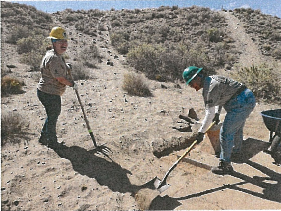
Crew members clear sand around a bench and path at Cerro Tomé Park