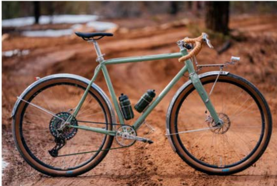
A bicycle manufactured by Baphomet Bicycles, a new manufacturing company based in Valdez.