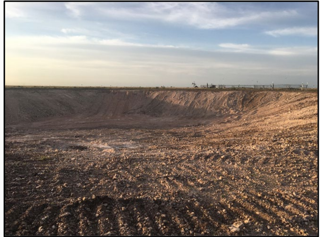
Permian Basin Caliche Pit Reclamation