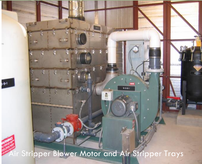
Air Stripper Blower Motor and Air Stripper Trays