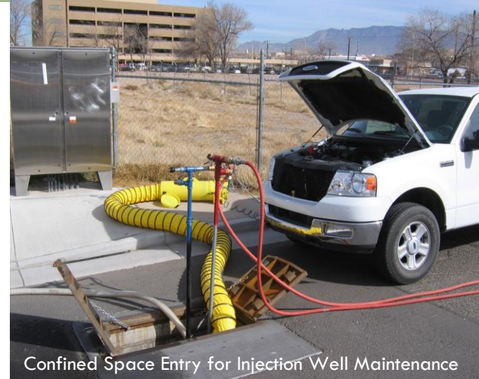
Confined Space Entry for Injection Well Maintenance

Orphan TCE plume in downtown Albuquerque. Pump and treat reduced contamination in groundwater enough to transition the remedy to Monitored Natural Attenuation