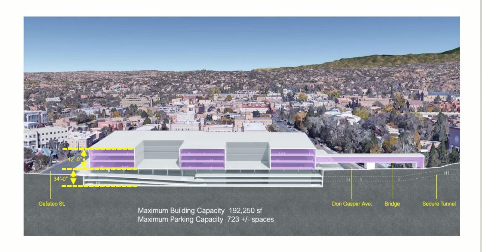
Exhibit A-07: Executive Office Building Site Capacity Study, West Site - Building Section