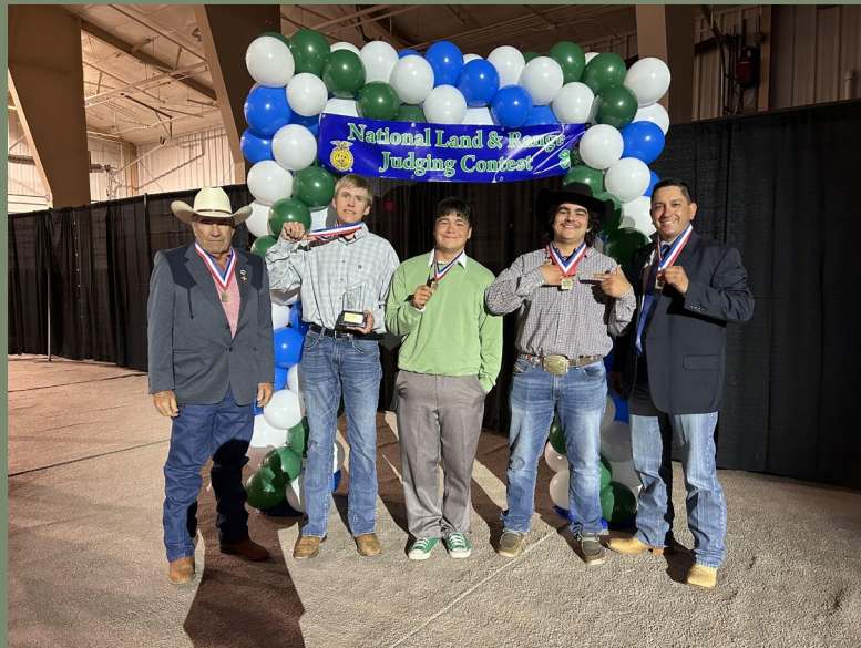
Sierra County 4-H 4 th Place Land Judging at National Competition