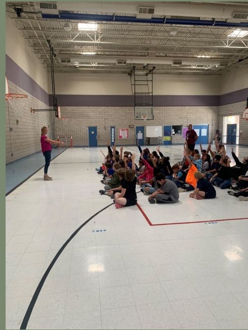
4 th Grade – Byproducts