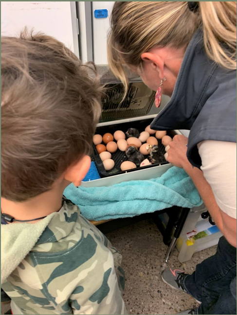
3 rd Grade – Egg to chick