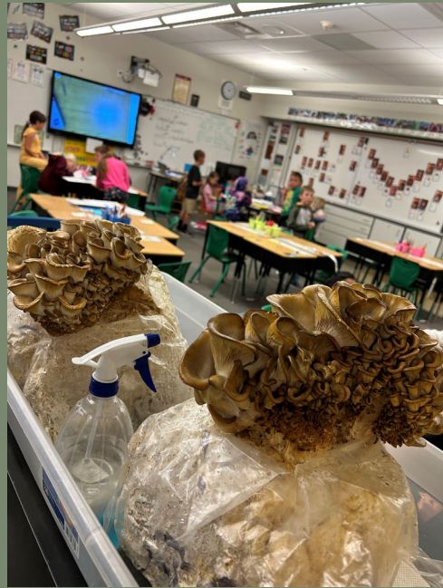
2 nd Grade – Mushrooms