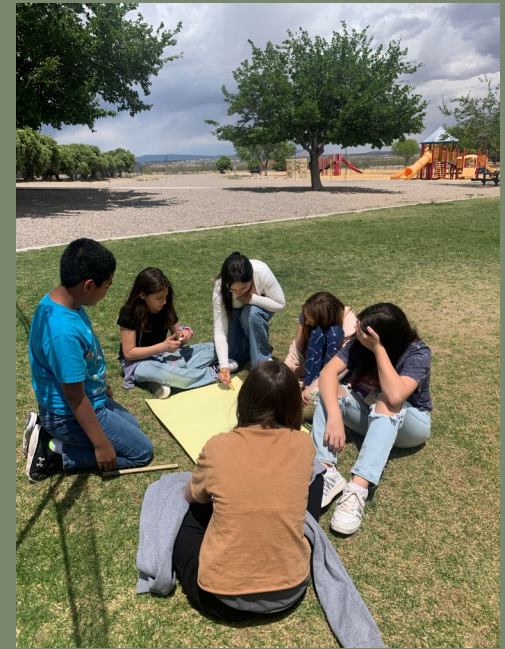
5 th Grade – Range Mgmt