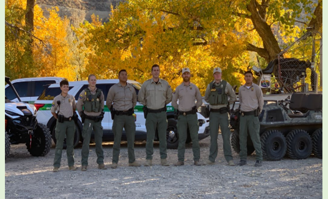
Park Rangers at Navajo Lake State Park

No new FTEs were requested for State Parks