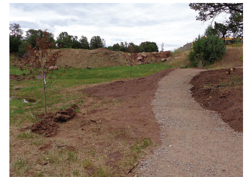
Helping our Schools Corps members constructed a walking trail on Pecos School District property in San Miguel County. Project Sponsor-Pecos School District