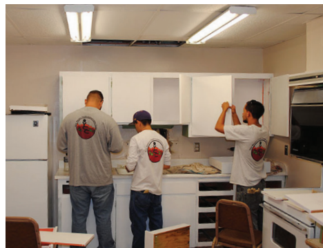
Teaching Trades Corps members remodel the kitchen at the Del Norte Community Center Enhancement Project. Project Sponsor-City of Tucumcari, Quay County