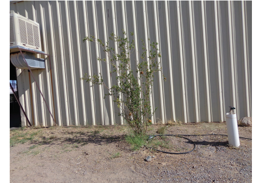
Keeping it Green Planting shrubs as part of landscaping project at the Hidlgo County Fairgrounds. Project Sponsor - Wellness Colalition