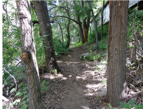
Connecting New Mexico Trail construction along the Big Ditch in Silver City. Project Sponsor-Aldo Leopold Charter School, Grant County