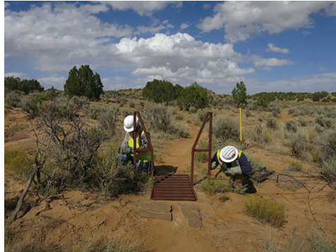
Outdoor Recreation Cattle guard (for bikes) installed by Corps members on the High Desert Trail, Project Sponsor-City of Gallup, McKinley County