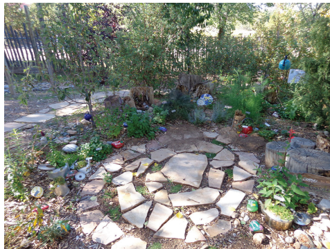
Nature Inspired Art Corps members designed and installed a labyrinth at the Santa Fe Children's Museum. Project Sponsor Santa Fe Children's Museum, Santa Fe County