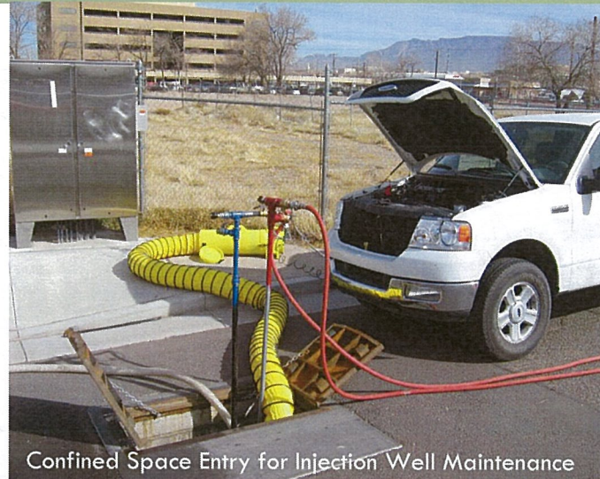
Confined Space Entry for Injection Well Maintenance

Orphan TCE plume in downtown Albuquerque. Pump and treat reduced contamination in groundwater enough to transition the remedy to Monitored Natural Attenuation