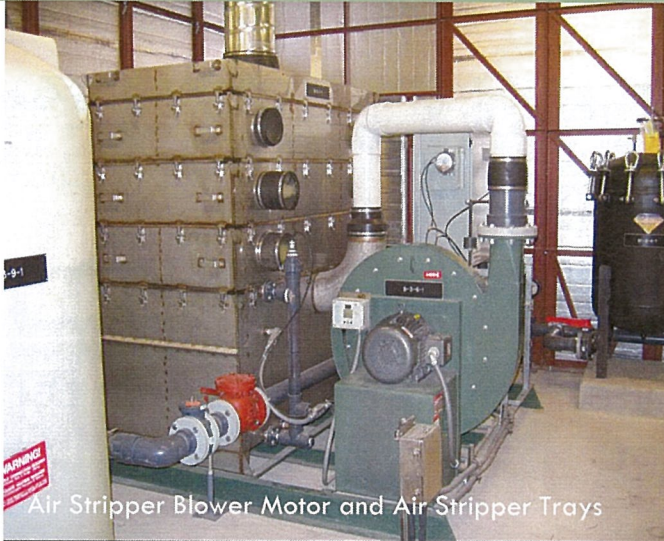
Air Stripper Blower Motor and Air Stripper Trays