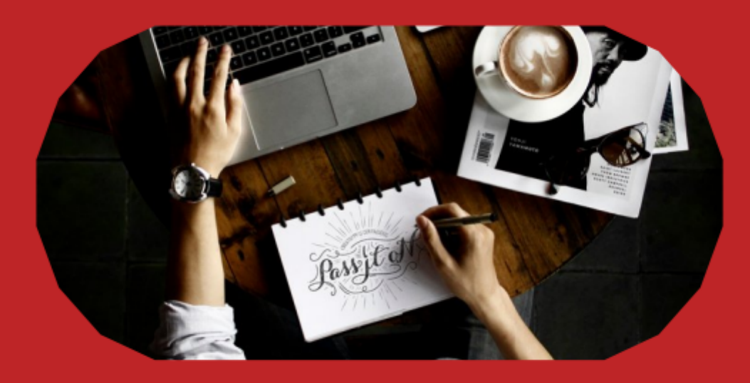
NMTC Supports Engaging in PPP to achieve Specific Goals

By providing direct grants, or partnering with providers and tribes or municipalities to provide the matching funds for federal grants, New Mexico can support its own infrastructure growth by those ready and willing to build it. WE SUPPORT NM PREFERENCE.