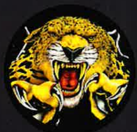
Coronado Middle and High School 6-12

Our Vision The Jemez Mountain Public Schools will graduate students prepared with the knowledge and skills essential to function in a democratic society. Our Mission The Jemez Mountain Public Schools will work with families and the community to provide sound academic programs, proficient staff, adequate support services, responsible fiscal management and safe facilities conducive to learning. We will support a vision of excellence that students may reach their fullest potential as educated citizens.