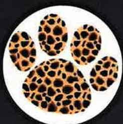
Gallina Elementary K-5