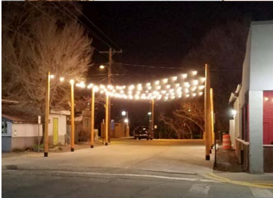
Silver City Main Street Plaza