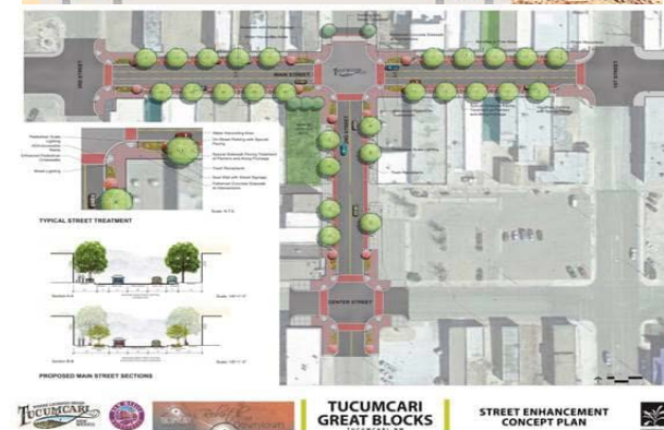
Tucumcari MainStreet's Second Street Great Blocks Project - June 2020