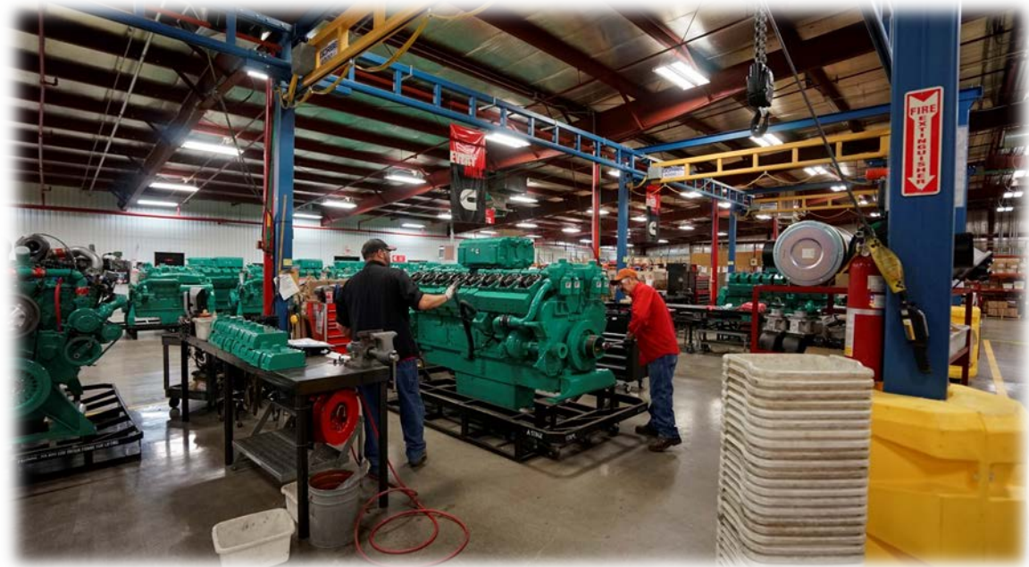
Cummins Natural Gas Engines, Clovis