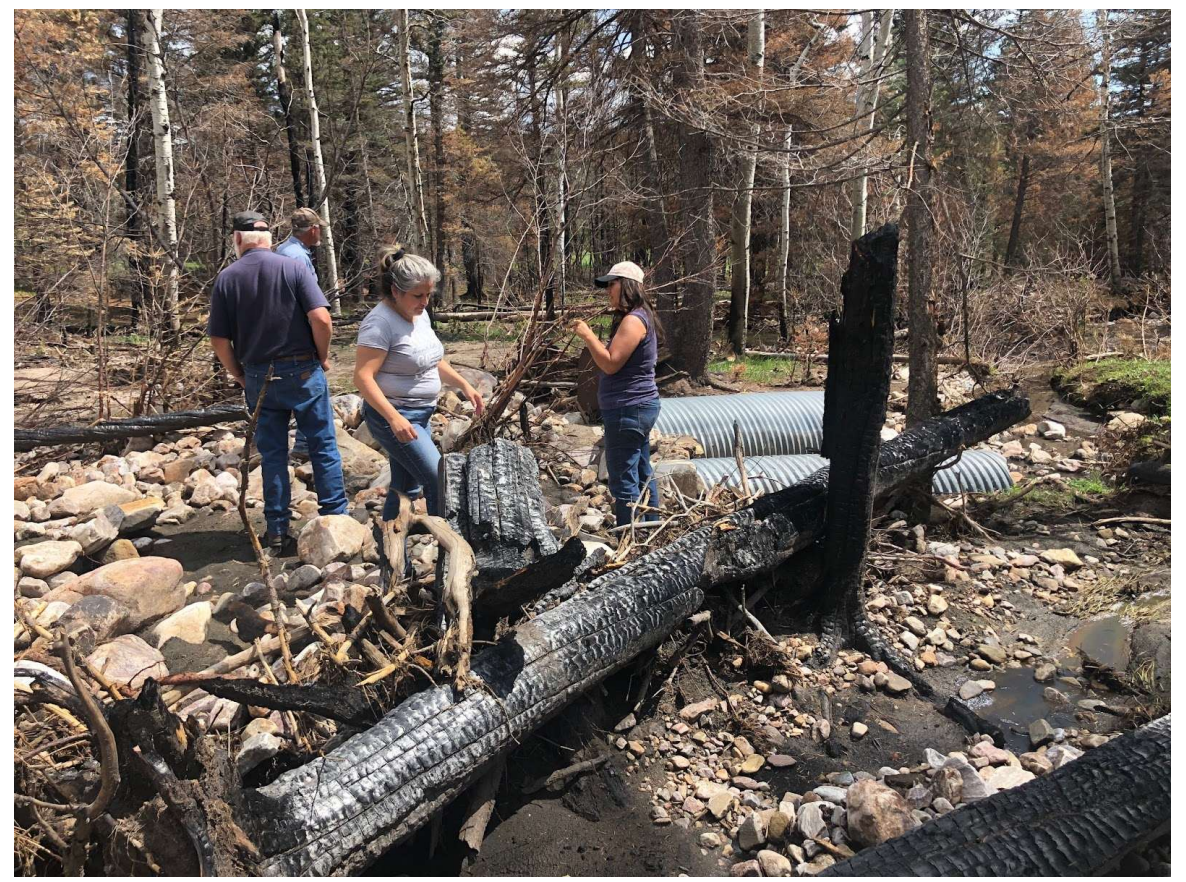
Heavy debris flows destroyed the diversion for Acequia del Sombrillo in Mora County after the HPCC fire and post-fire floods. This area is prone to recurring flooding (cascading events).