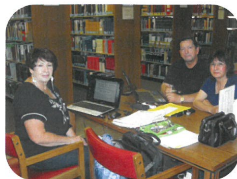
Family Research at the ABQ/Bernalillo County Special Collections Library Genealogy Center

■ Flat or Shrinking Budget (88%) ■ Increasing Budget (12%)