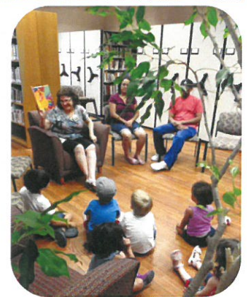
Bilingual Storytime at the National Hispanic Cultural Center Library

Compared to other U.S. states, New Mexico has a limited infrastructure for library resource sharing, such as shared catalogs or courier services, and some assessment participants questioned the current allocation of public library resources at the state level. Both library supporters and staff emphasize the need for sustained advocacy on behalf of New Mexico libraries. And, the increased prevalence of utilizing school libraries for mandatory testing is having a negative effect across New Mexico.