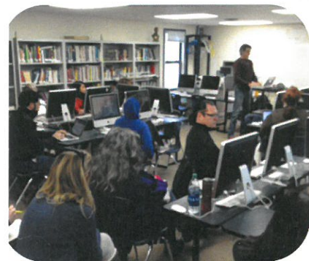
Professional Development Days in the School Library. TISNM Charter School