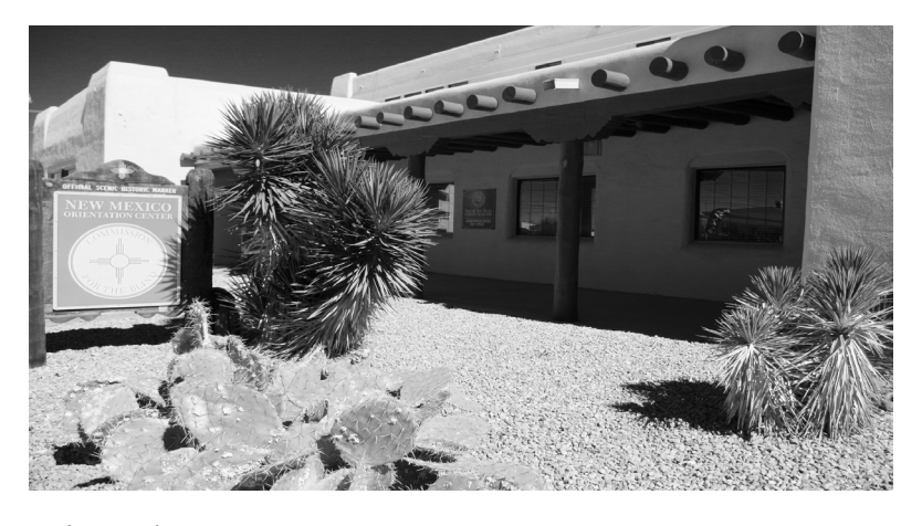
Orientation Center Alamogordo, NM

The training is built around the use of "learning shades" to eliminate the student's desire to rely on inadequate or failing vision. By learning effective nonvisual techniques, students gain self-confidence and learn how to function as successful blind persons.