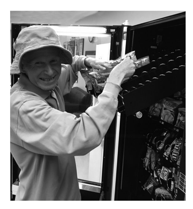
John Blake Business Enterprise Program

A BEP vendor also serves the food and dining needs at the Federal Law Enforcement Training Center in Artesia. The Federal Law Enforcement Training Center (FLETC) provides training to 91 federal agencies, as well as to local, state, and tribal law enforcement agencies.