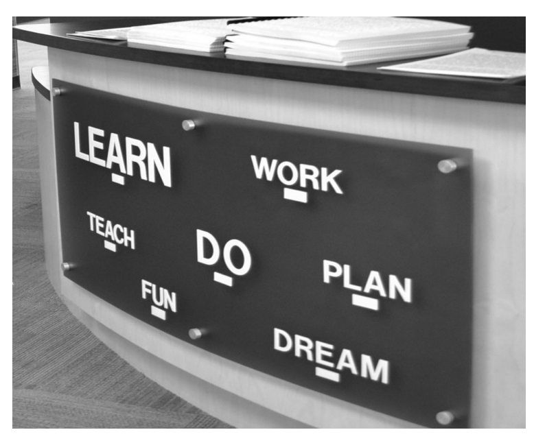
Skills Center Albuquerque, NM

he Skills Center is a state-of-the-art facility that helps meet the needs of the Commission's vocational rehabilitation and independent living consumers. Located in the Albuquerque office, the Skills Center has classrooms for specific subject areas such as Braille, technology, cooking, and personal management. It also has a large lecture room that is ideal for group meetings. The Skills Center was used to teach young students participating in the STEP program, to provide a venue for the Unified English Braille trainings and certification exams, a college prep workshop, and to instruct many other persons who were attending different events and seminars.