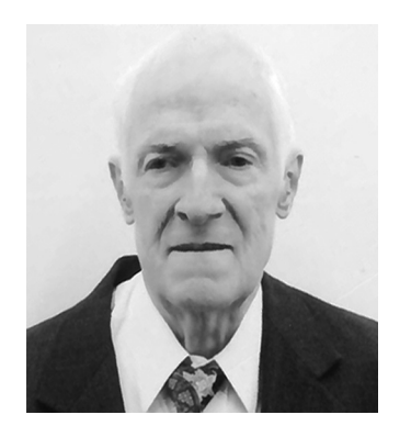
Jim Babb Commissioner Albuquerque