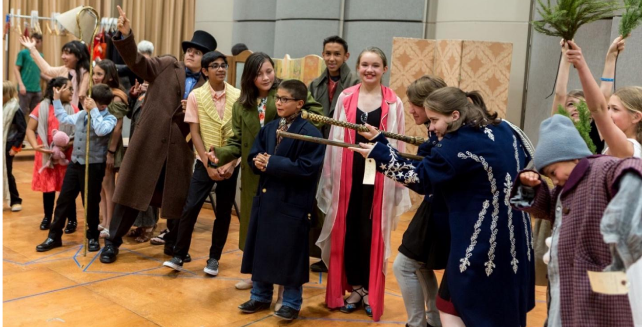
Youth Night attendees acting out Act Two of Puccini's La bohème at the June 24, 2019 presentation of "3, 2, 1... Opera!"

Since 1959, youth groups have attended final dress rehearsals of age-appropriate mainstage productions each season. Since its inception, Youth Nights have introduced more than 100,000 children to opera.