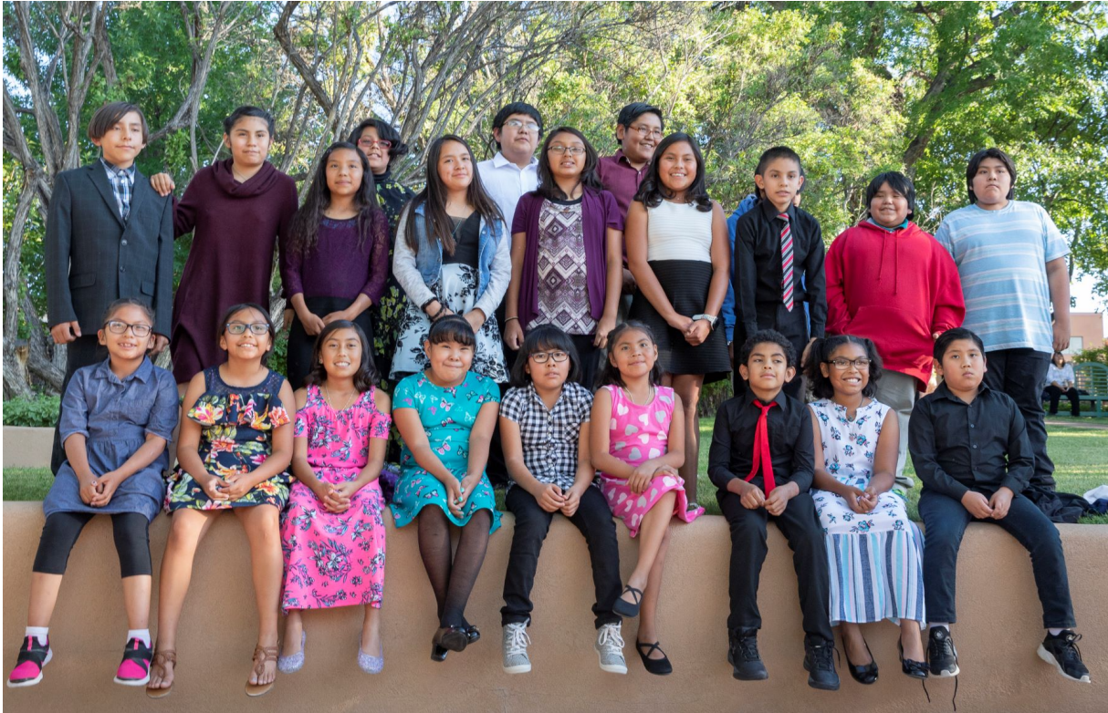
Youth from Sandia Pueblo at the July 9, 2019 POP dinner held prior to the Youth Night performance of Mozart's Cosi fan tutte.

Celebrating its 50th Anniversary in 2023, the Pueblo Opera Program forges strong connections between the opera and New Mexico's 23 Indigenous Nations. The program's hallmark is an exchange of culture: opera is a specific culture with distinct traditions and the pueblos and reservations have a very rich and deep tradition of storytelling and music, providing a common language and place to begin. An advisory council comprised of past participants and elders from participating pueblos and reservations guides the program, and each nation has its own volunteer coordinator. The pueblos attend all Youth Nights, and prior to the performance, they are served a healthy and nutritious meal in the Cantina from program sponsor Omaha Steaks. Given some nations are two to three hours away, the opera provides free round-trip transportation via coach. The President's Committee on the Arts and Humanities recognized POP as an exemplary arts & humanities program for at-risk children and youth in its 1996 publication, Coming Up Taller . Since its inception, the program has benefited over 120,000 children and their families.