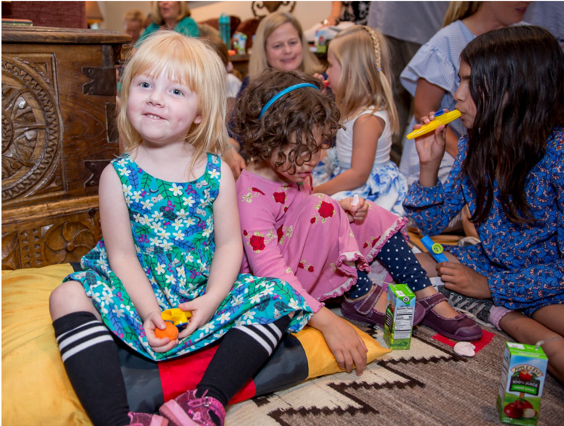
Young participants at the 2019 Opera Makes Sense which was held at the New Mexico Governor's Mansion.