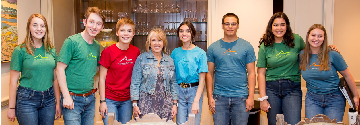
Members of the Young Voices with New Mexico Governor Michelle Lujan Grisham at The Governor's Mansion where they performed for the Opera Makes Sense program held on June 29, 2019.

An audition-based mastery program for students in high school grades 9-12 who are at least 14 years of age, the Young Voices of the Santa Fe Opera program provides singing lessons, music and diction coaching, master classes and public performance opportunities for young aspiring singers. Participants attend concerts, dress rehearsals and programs that foster an understanding and appreciation of operatic singing. Instruction is provided free-of-charge by Santa Fe Opera artists and music staff. Lessons and coaching sessions are held in Albuquerque and Santa Fe, and students receive career counseling, college application assistance and college scholarship opportunities.