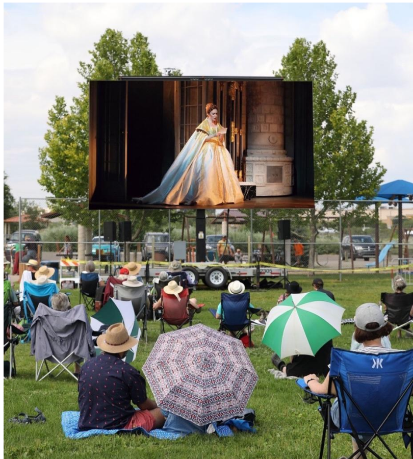
Opera in the Park's free screening of Tchaikovsky's Eugene Onegin at Villa Linda Park in Santa Fe on August 2, 2021.