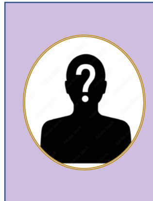
Vacant Acequia Projects Manager II