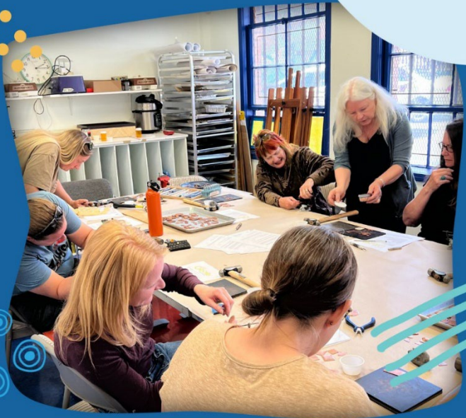
National Arts & Health Day July 26, 2025