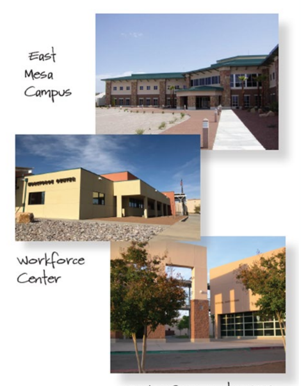
Espina Campus at NMSU