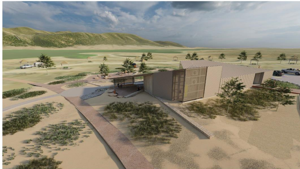
Eagle Nest Lake State Park

Comfort Station Design: 42 Marina Wy, Eagle Nest, NM 87718 Date: 2/20/2023