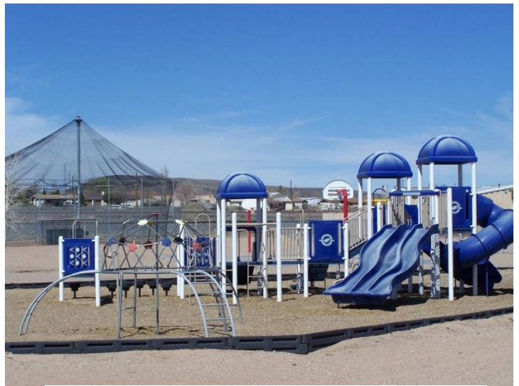
Isleta Pueblo Youth Recreation Center - 1973