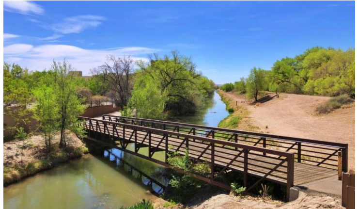
Albuquerque's Paseo del Bosque Trail - 1977