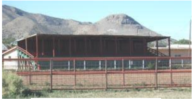
Magdalena Rodeo Grounds - 1979