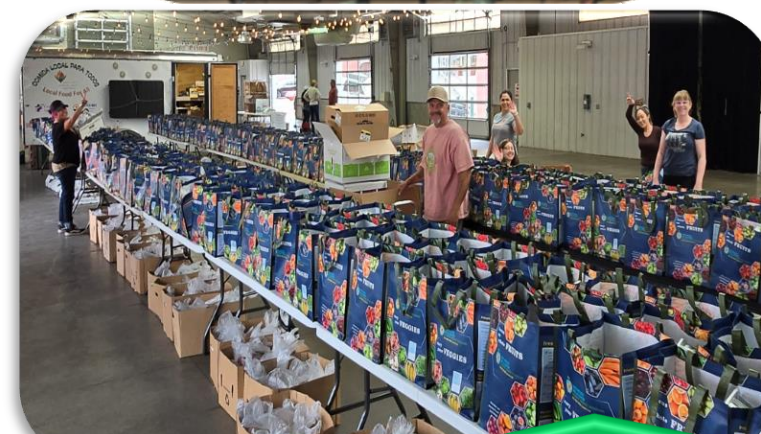
Delivered directly to seniors in rural and tribal communities.