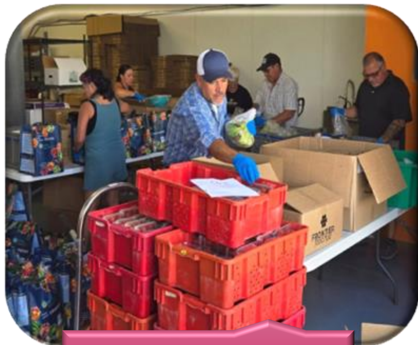
Partner with NM Grown farmers to assemble fresh produce boxes.