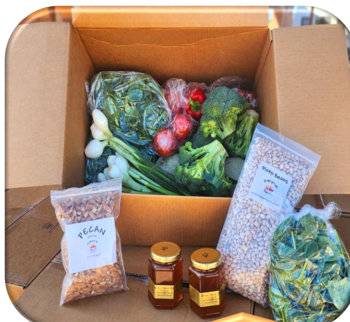
Includes beans, posole, honey, chile pods, fruits, vegetables, and herbs.