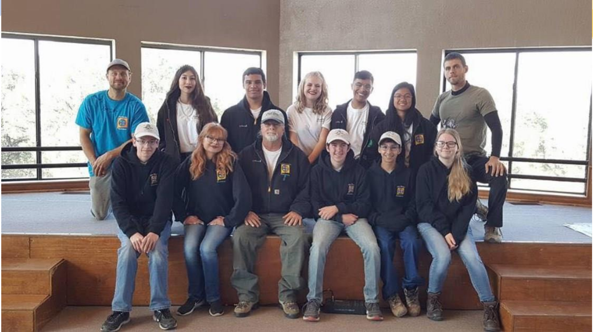
NM Team 5 th Place in National Competition