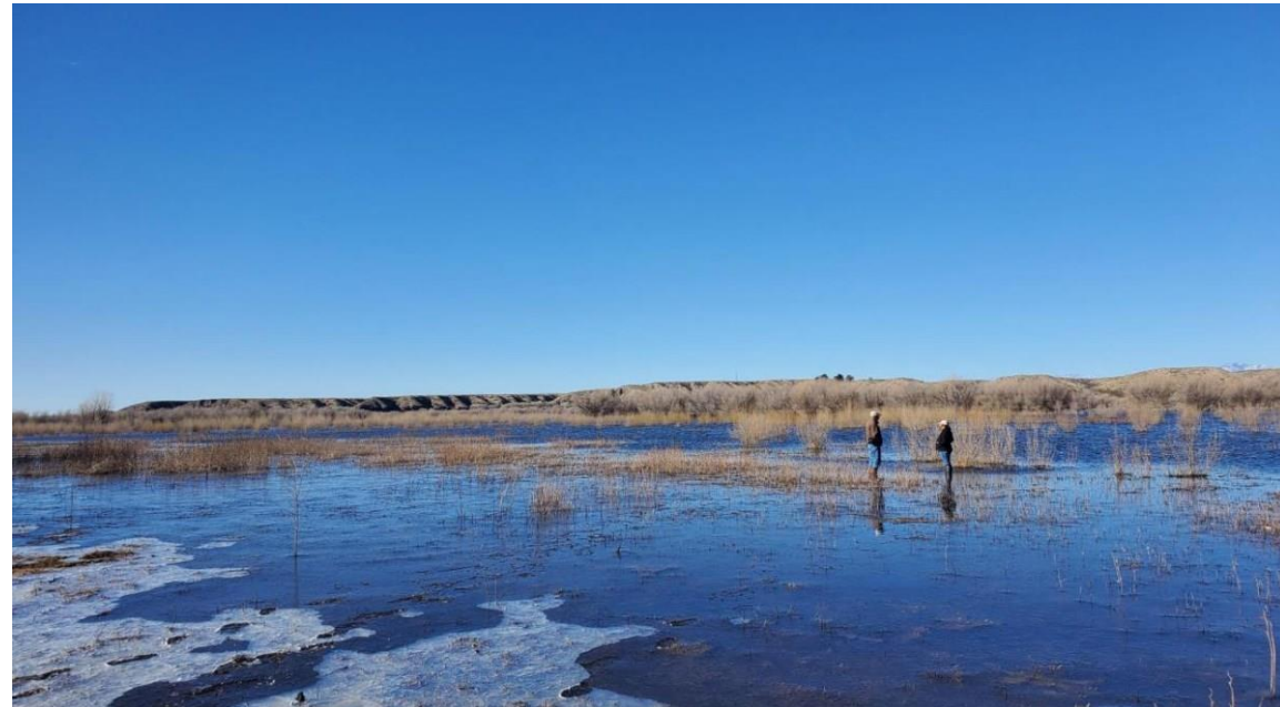
Black Willow Harvesting for BOR by Sierra SWCD