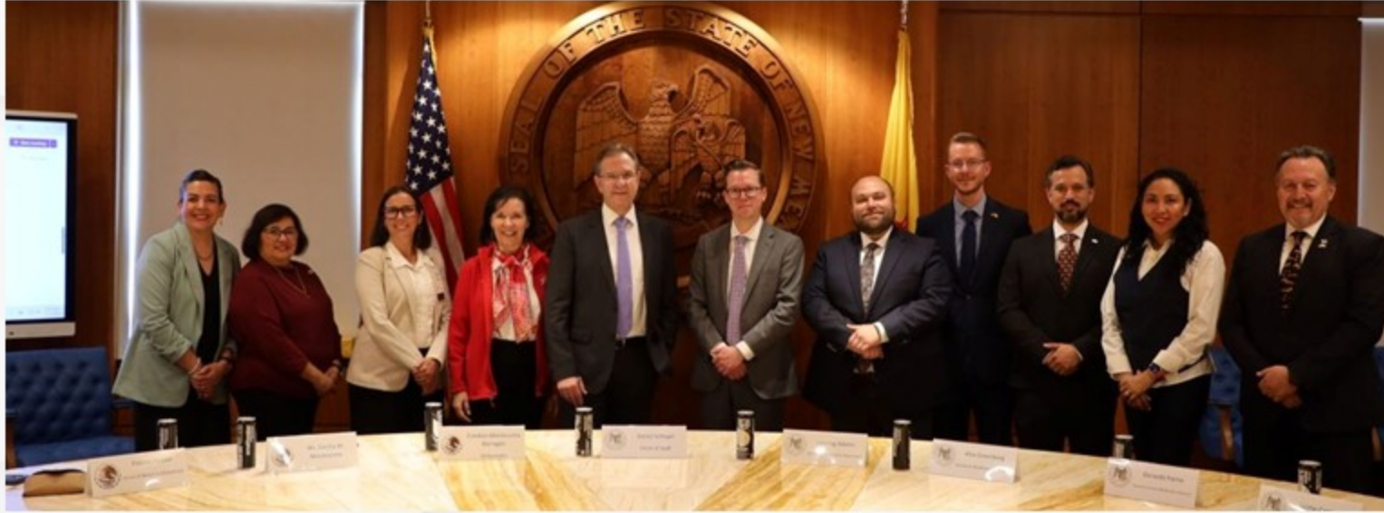
Meeting with Mexico's Ambassador to the United States, Esteban Moctezuma Barragán, and the Office of Governor Michelle Lujan Grisham - Santa Fe, New Mexico.

Reinforced alignment with federal, state, and local governments in Mexico