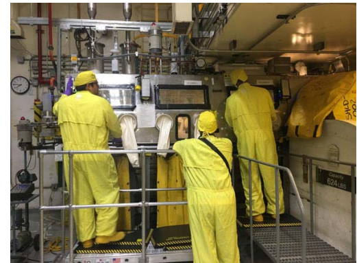
LANL Waste Glovebox Operations