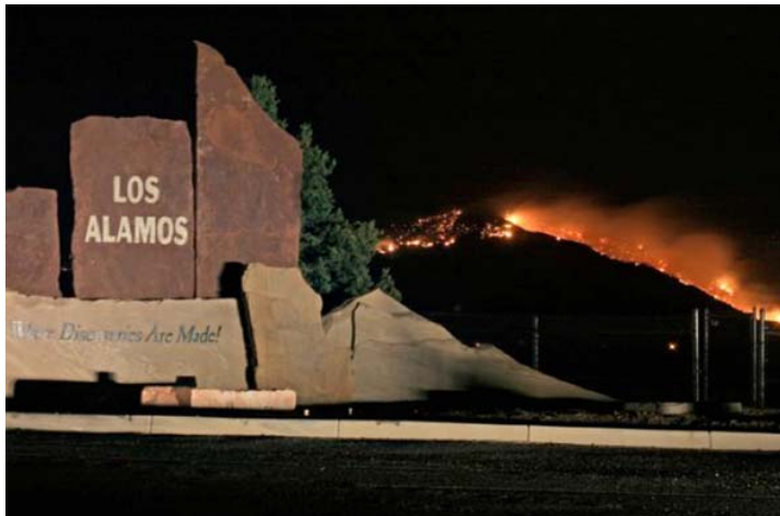
2000 Cerro Grande Wildland Fire