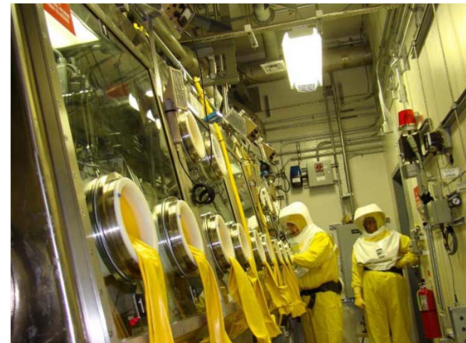
Glovebox Operations at Savannah River Site

DOE is required by law to grant the Board “ready access to such facilities, personnel, and information as the Board considers necessary to carry out its responsibilities.”