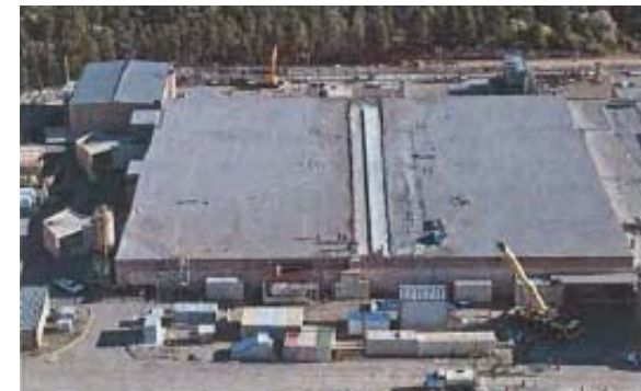
Plutonium Facility Structural Seismic Improvements