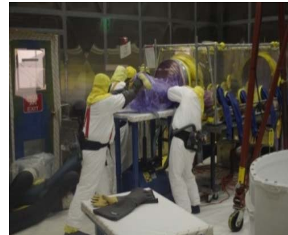
Operations at Area G