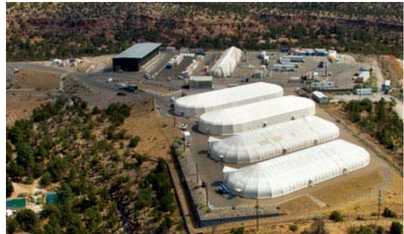
Transuranic Waste Storage at LANL Area G