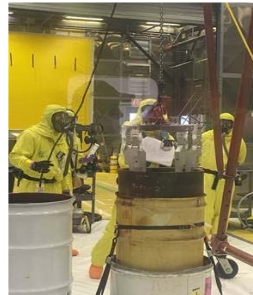
Waste Remediation at Area G