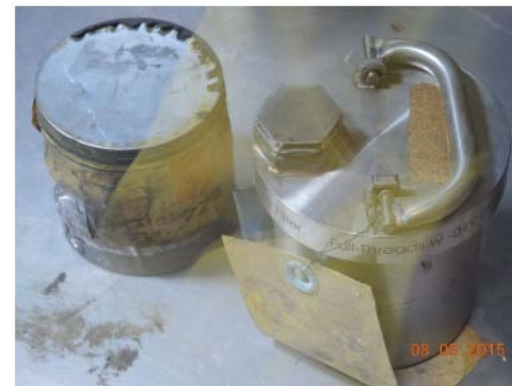
Examples of storage containers and conditions for nuclear materials in the Plutonium Facility