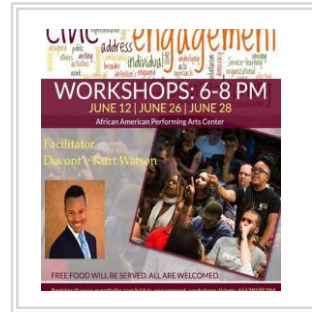
Advocacy and Policy