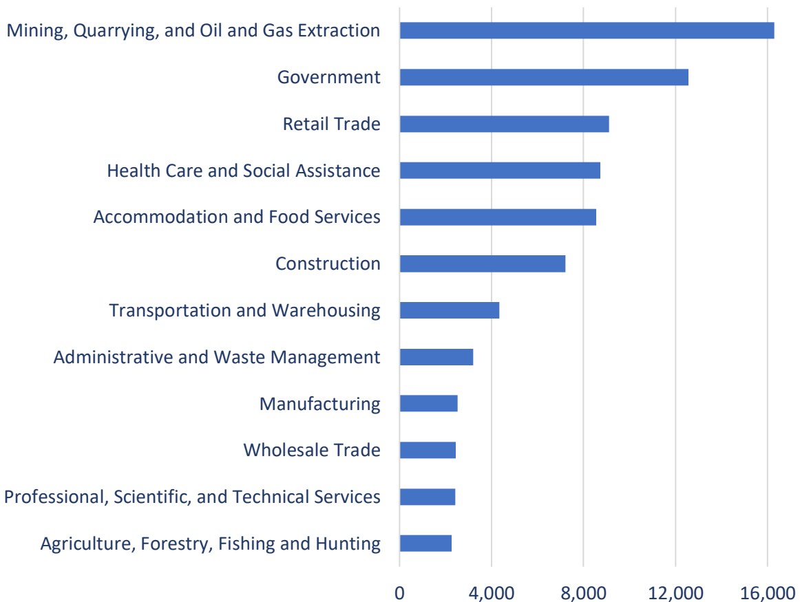
Employment, Top Industry Sectors, Region K

An Employment Location Quotient is an indexed value that illustrates the concentration of an industry in a particular location. An LQ of 1.0 indicates that employment in the target industry is exactly equal to the national average. An LQ of 2.0, then would indicate that employment in the target industry is double the national average.