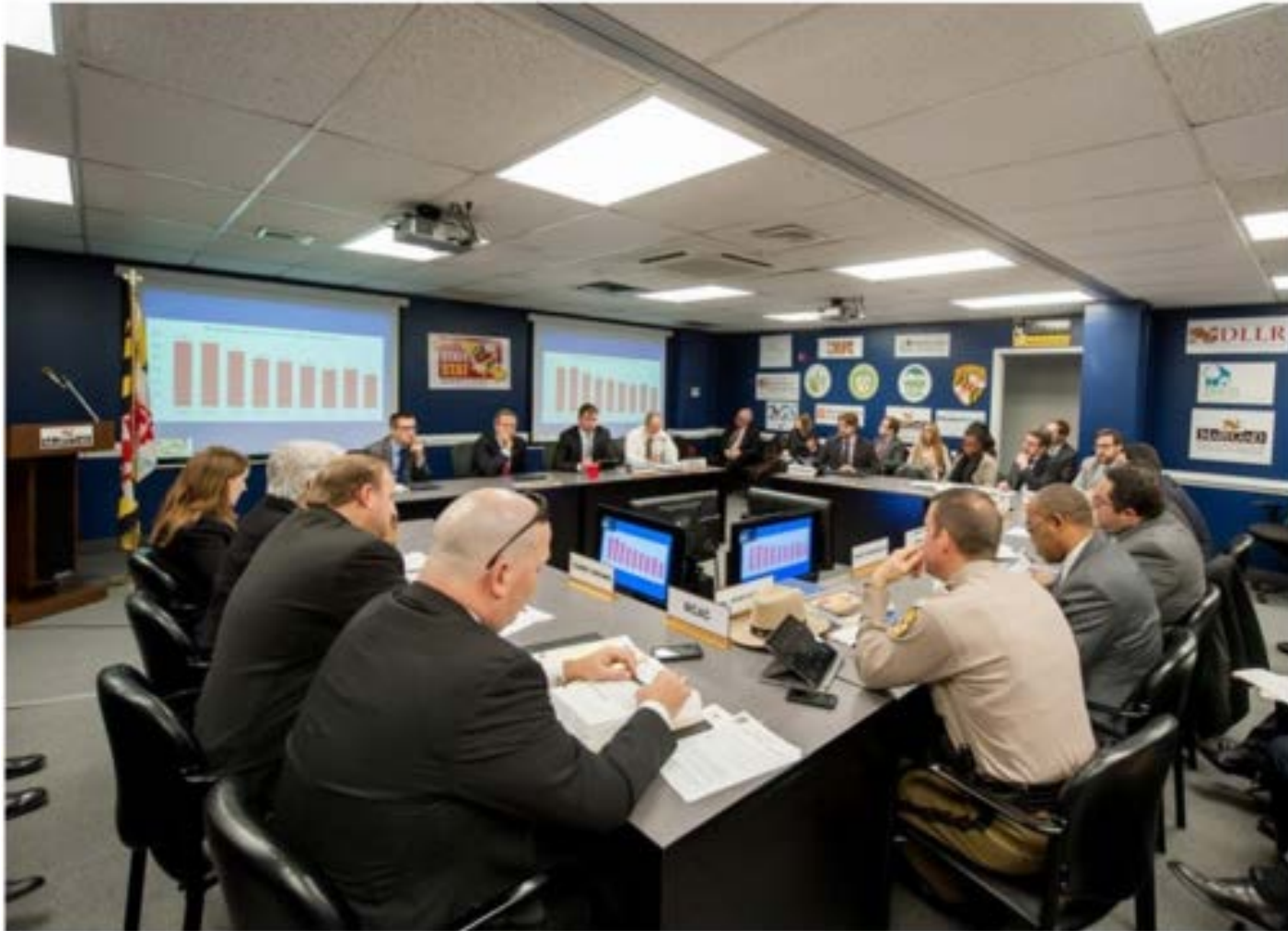
StateStat in Maryland (By agency and priority)