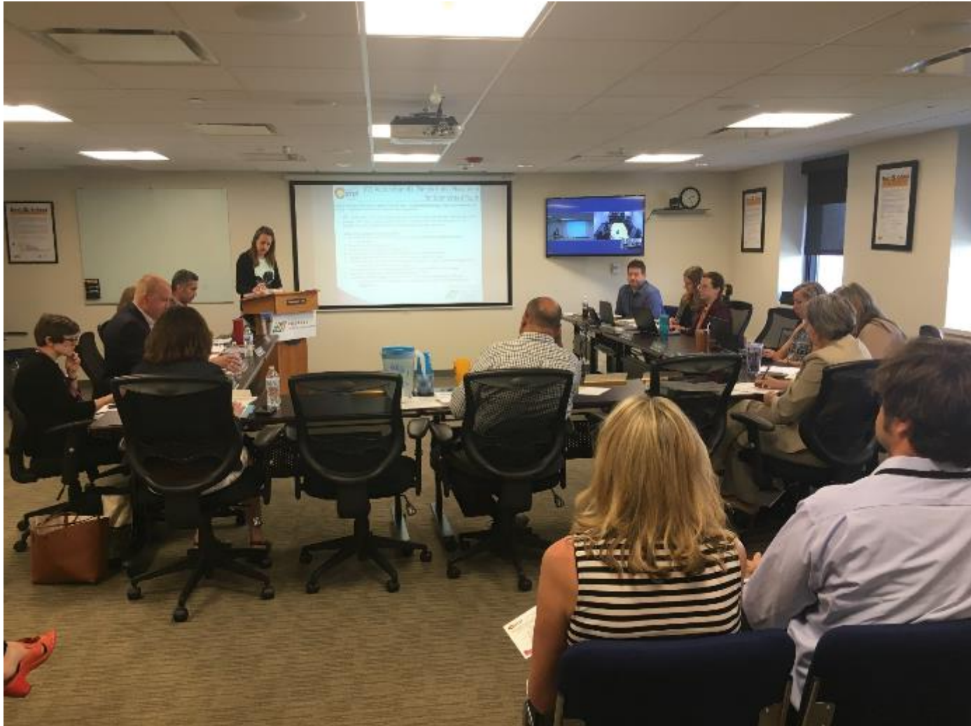
CStat at the Colorado Dept. of Human Services (By division)