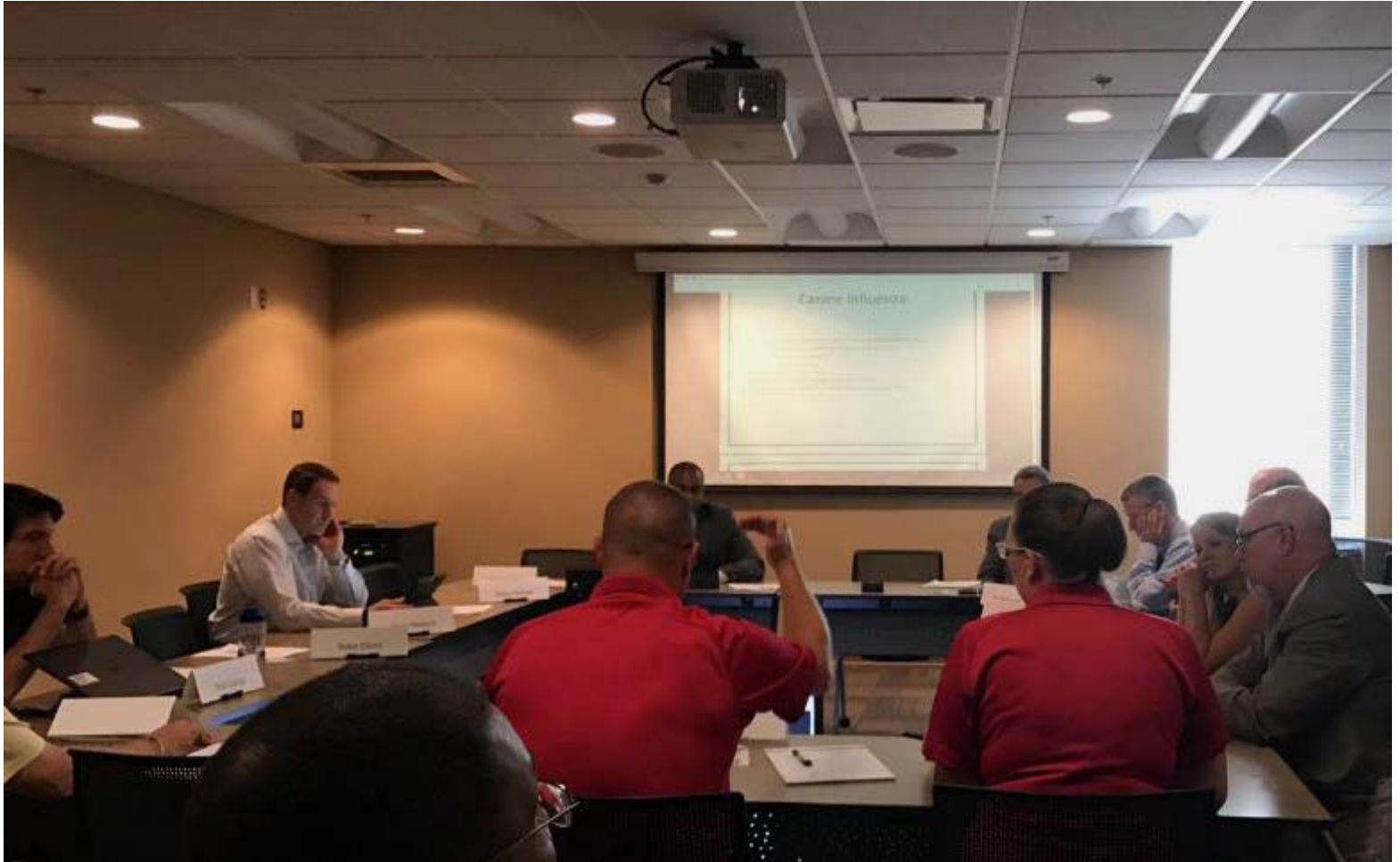
LouisStat in Louisville, KY (By agency and priority)